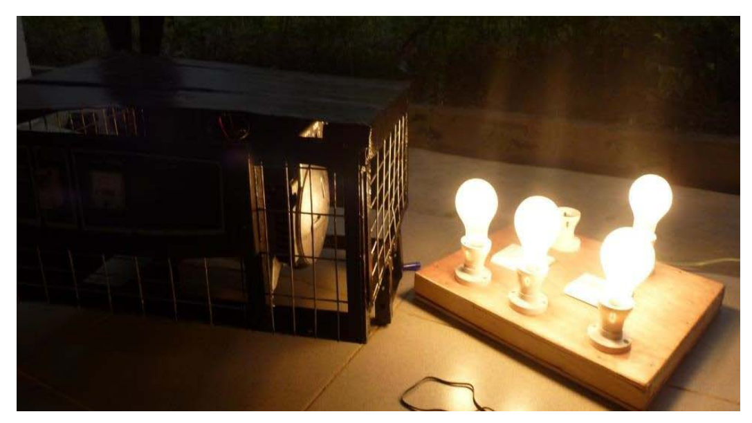
1KVA Fuelless Power Generating Set