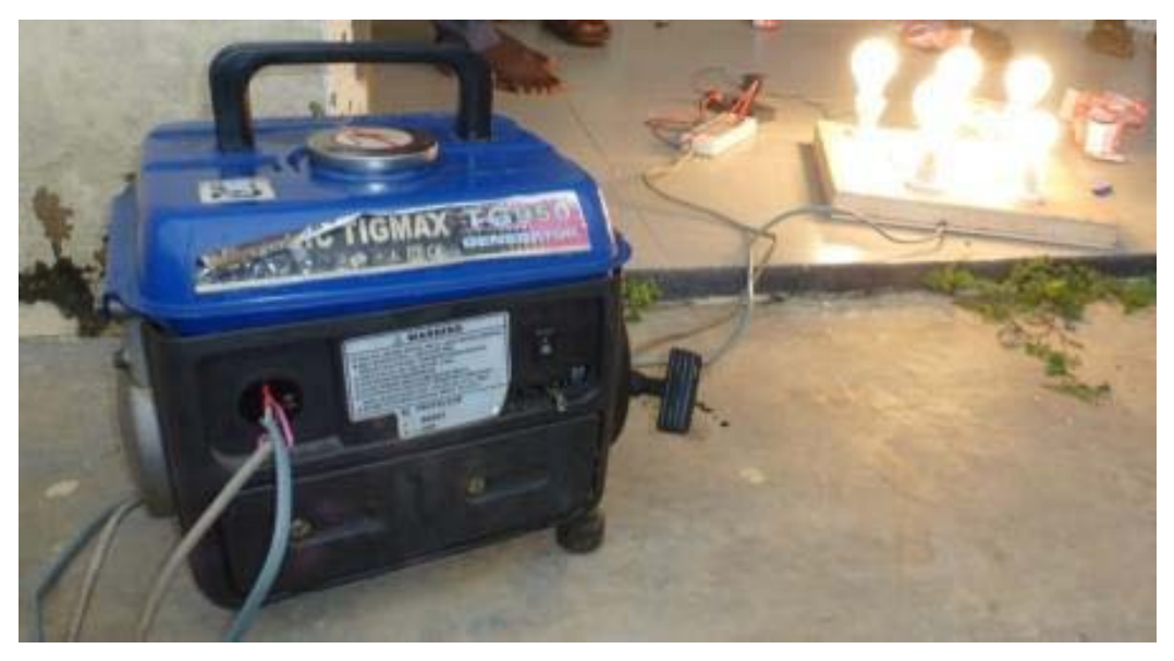
1KVA TIGMAX Gasoline Generating Set