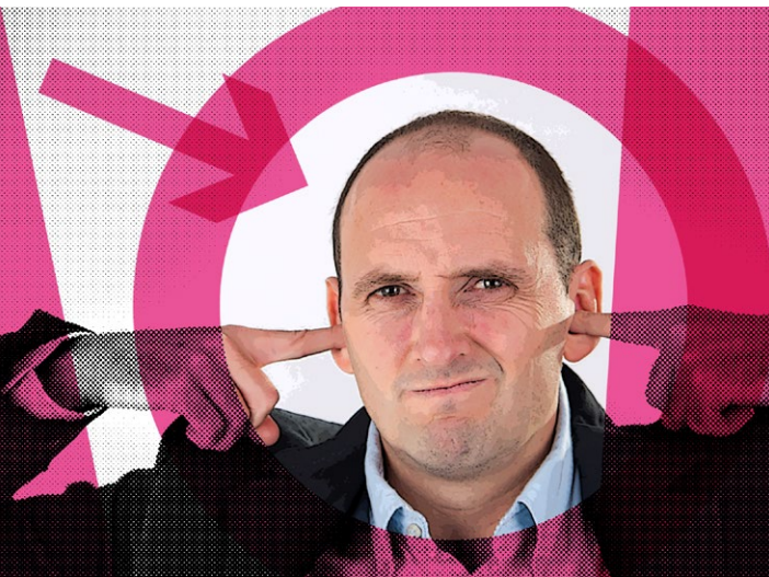
Using the wrong words can reinforce negative stereotypes

See the TUC briefing, Words Can Never Hurt Me? for a detailed explanation of how the choice of language can help or hinder our campaigning for disabled rights.