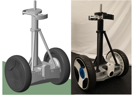
Fig. 1. CAD model & physical system, a modified Ninebot Segway.

We are particularly interested in learning-based approaches that guarantee Lyapunov stability [21]. From that perspective, the bulk of previous work has focused on using learning to construct a Lyapunov function [31], [12], [30], or to assess the region of attraction for a Lyapunov function [9], [6]. One limitation of previous work is that learning is conducted