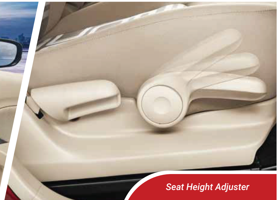
Seat Height Adjuster