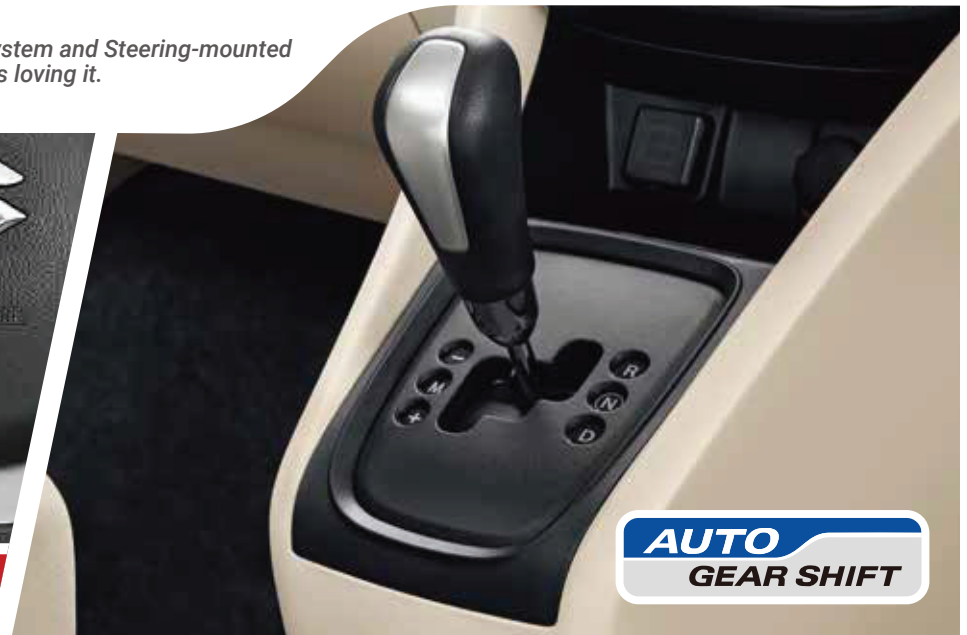
AUTO GEAR SHIFT