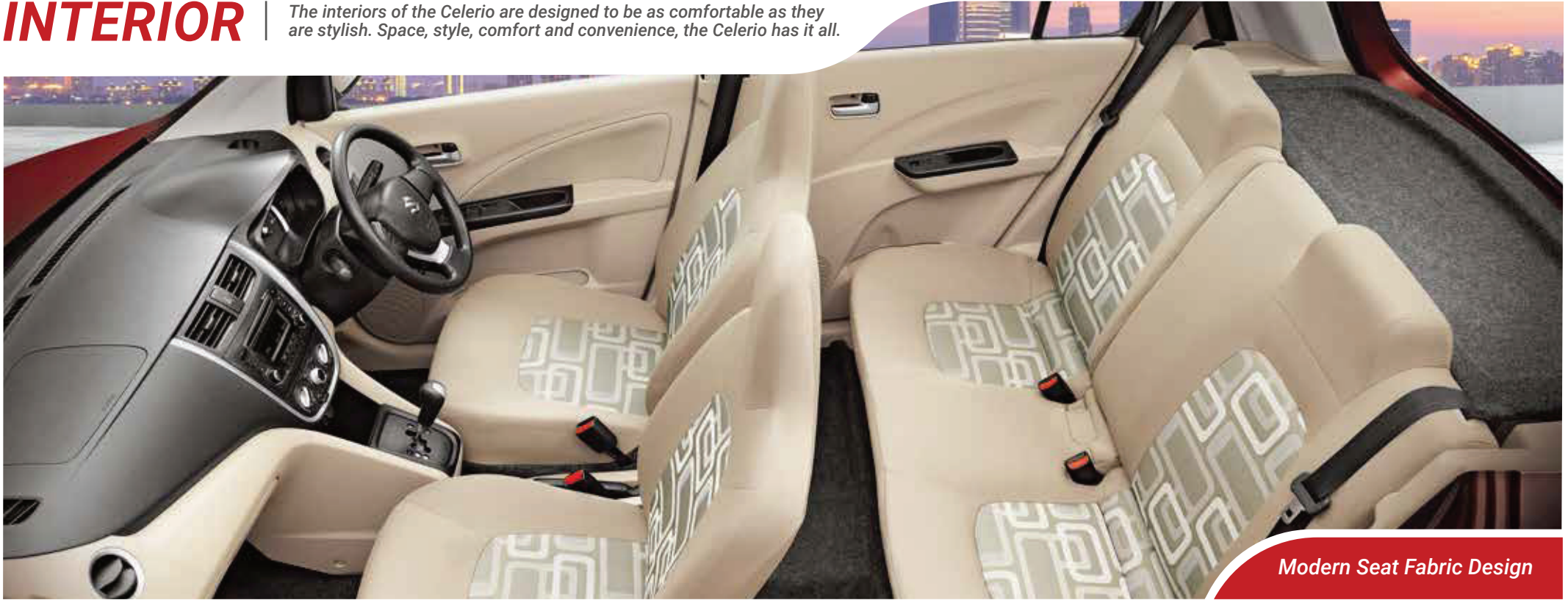
Modern Seat Fabric Design

The interiors of the Celerio are designed to be as comfortable as they are stylish. Space, style, comfort and convenience, the Celerio has it all.