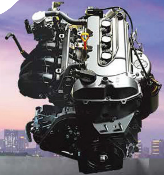
1L K-series Engine