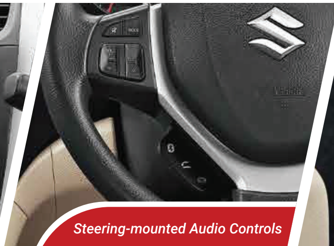
Steering-mounted Audio Controls