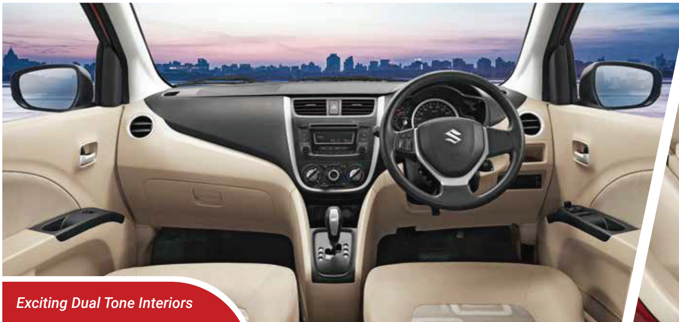
Exciting Dual Tone Interiors