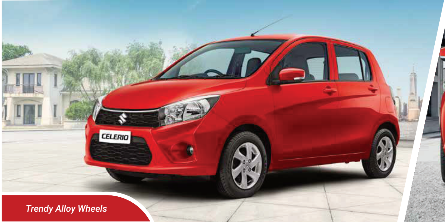
Trendy Alloy Wheels

From its Front Grille Design to elegant Back Door Garnish, the Celerio keeps it light and fresh from every angle.