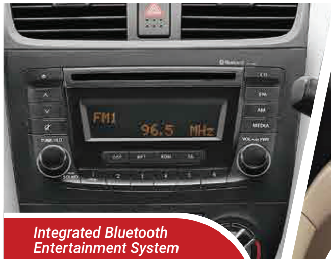
Integrated Bluetooth Entertainment System

AGS Technology, an Integrated Bluetooth Entertainment System and Steering-mounted Audio Controls in the Celerio make driving it just as easy as loving it.