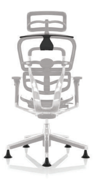
COAT-HANGER* / BLACK GLIDES *COAT-HANGER CURRENTLY NOT AVAILABLE ON LUXURY MODEL