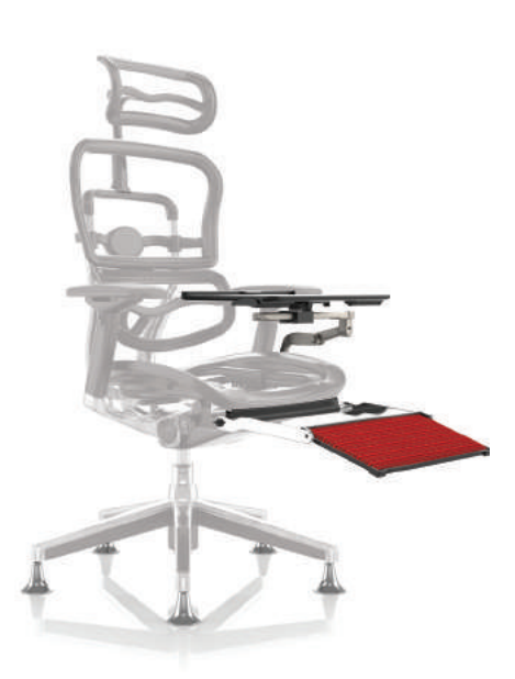
NOTEBOOK STAND** / LEGREST** / POLISHED GLIDES **NOTEBOOK & LEGREST NOT AVAILABLE ON CLASSIC MODEL