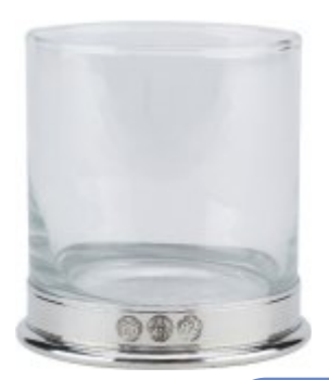
575/1 575 (STOCK BOX)