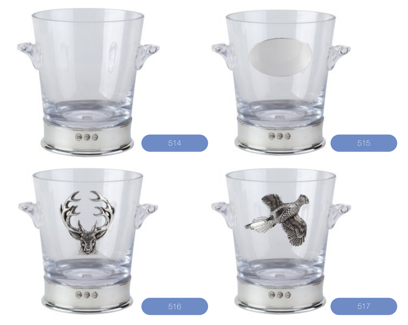
ICE BUCKET 800ml | 127mm x 153mm x 95mm