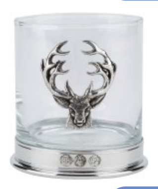
577/1 577 (STOCK BOX)