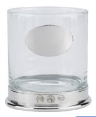
576/1 576 (STOCK BOX)