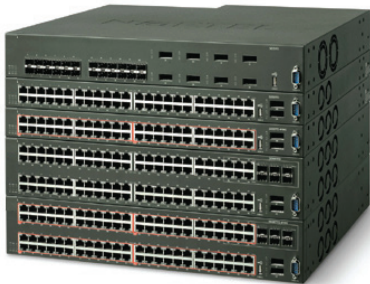
Ethernet Routing Switch 5600 Series

Avaya's industry-leading resilient Stackable Chassis provides high-availability for delay-sensitive and business-critical data and voice applications. Up to eight Ethernet Routing Switch 5000 units can form a resilient Stacked solution, manageable as a single entity, of up to 400 ports, with maximized uptime even if an individual Switch within the Stack should fail.