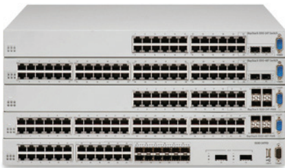
Ethernet Routing Switch 5500 Series

The Avaya Ethernet Routing Switch 5000 series is a set of premium Stackable LAN Switches providing the resiliency, security and convergence readiness required for today's high-end Wiring Closets, high-capacity Data Centers and smaller Core environments.