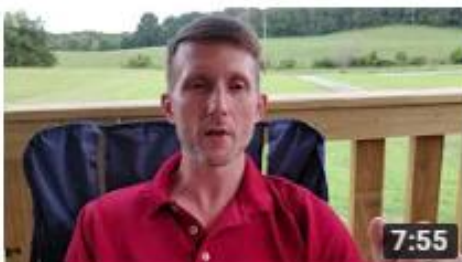
Three Arguments for God's Existence

Sandel's view on "public reason" and why it is incorrect.