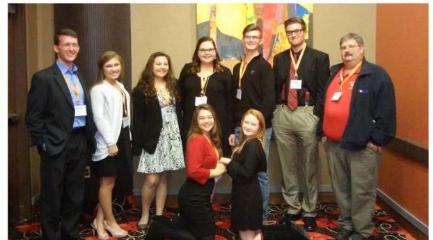
The original Sequoyah High School Ethics Bowl Team, circa 2016