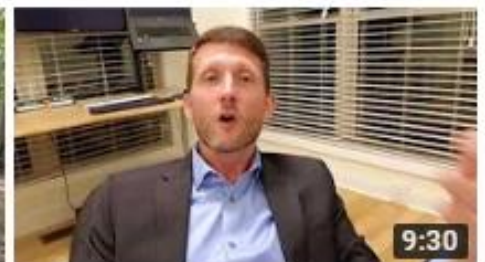
Bertrand Russell's The Value of Philosophy