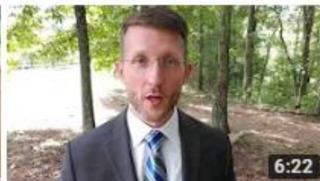
Plato's Sophist (focus on Philosophers vs. Sophists)