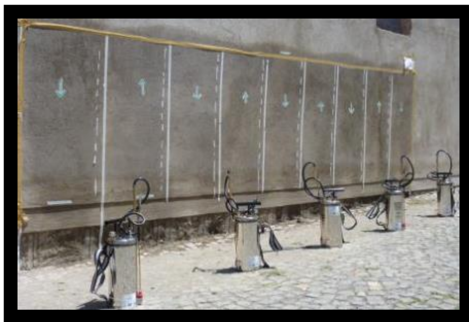
Training wall during TOT session in Adama Town 2017