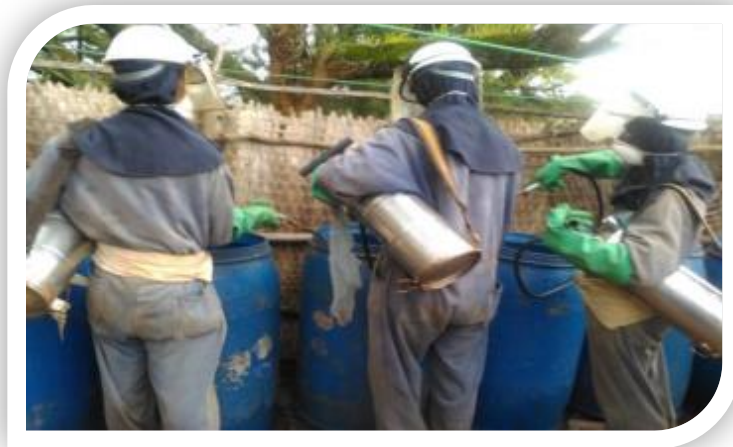
FIGURE B-1. END OF DAY CLEAN UP ACTIVITY IN NEDJO DISTRICT 2017