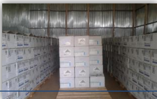
FIGURE 3. ACTELIC 300 CS AND TOOLS STORE IN NEW DISTRICT OF ABE DONGORO

Stores were renovated in each of the 18 new IRS districts to accommodate insecticide and other IRS supplies. The stores were located at district health facilities and the district health office was charged with ensuring the security of IRS equipment and supplies. The storage area in stores in the 26 old districts was increased with addition of an extra 9m 2 area to accommodate the bulky Actellic insecticide and other IRS materials. District level stores served as distribution centers for IRS materials, equipment and insecticides during the IRS operations (Figure 3).