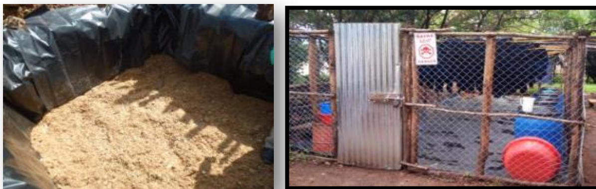
FIGURE 4. SOAK PIT AND PLASTIC SHEET LINING TO PROTECT SIDE LEAKAGE OF EFFLUENT IN AGALO METI DISTRICT

Pregnancy screening was conducted for all 607 female spray actors involved in the IRS operation. The test was conducted two times during the spray campaign. One female porter was found to be pregnant on the second test and was assigned data filing and documentation duties. In 2017, all spray actors underwent medical fitness screening before they enrolled in the spraying operation and only those who fulfilled the criteria were enrolled. Some 25 actors were found to be unfit and were not enrolled in the campaign. The physical condition of SOPs was also assessed during training process by trainers including the MFPs. In addition, the SLs assessed the physical condition of each SOP and porter every day during morning mobilization sessions using the daily health check list (Annex D, Tab D-6).