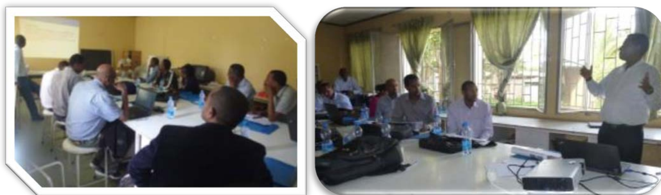
FIGURE 6. ENTOMOLOGY TRAINING ON WHO SUSCEPTIBILITY TESTING IN ADAMA IN 2017

Spray operations training conducted by AIRS Ethiopia as part of TOT in 2017 enhanced the capacity of 281 FMOH staff in IRS planning and implementation. The trained personnel in turn facilitated the training of SOPs and other actors at the district level. Besides, AIRS Ethiopia conducted Training of master trainers to enhance the TOT trainer's competency in IRS planning and implementation as well as facilitation skills. In order to enhance spray quality, all AIRS training initiatives paid special attention to spray techniques and supervision.