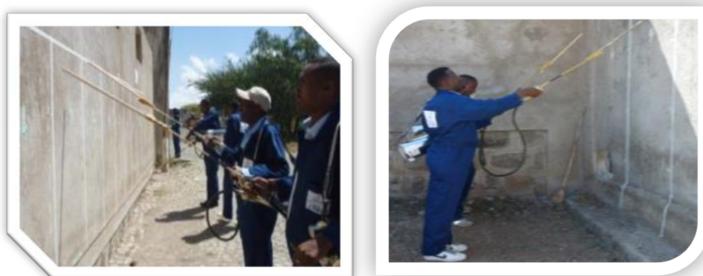
Trainees using water during a practical session on spray techniques in Adama in May 2017