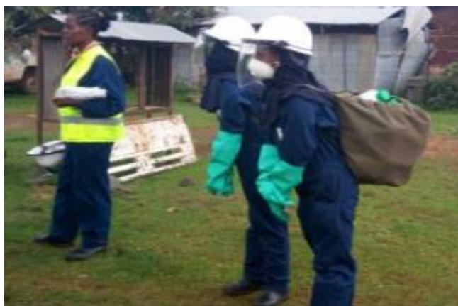
FIGURE 5. FEMALE SPRAY ACTORS IN FULL PPE DURING SPRAY OPERATIONS

The project trained 121 clinical practitioners on insecticide exposure management in one day. Districts were notified of the need to have the recommended antidotes (atropine and diazepam) on hand. AIRS ensured that at least one of the antidotes was available in the health facilities in the operational sites. There were reports from field supervision that showed that SOPs frequently forgot to take along their