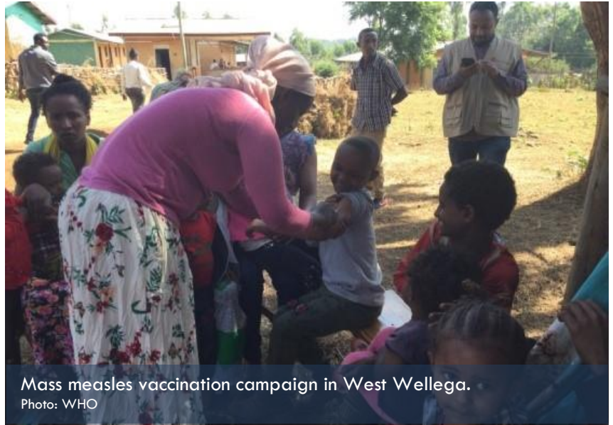
Mass measles vaccination campaign in West Wellega.