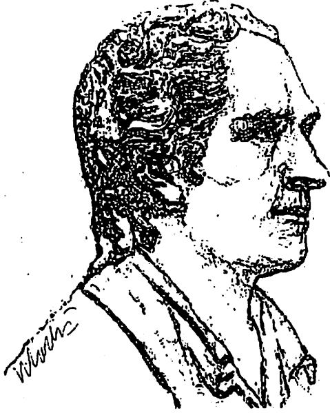
Christoph Wilhelm Hufeland (1762-1836)