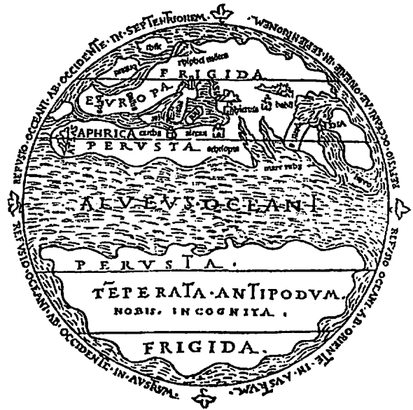
Macrobian World Map, 1483 facsimile.

As Alfred Korzybski, founder of the Institute of General Semantics had warned us early in the 1930's, maps are not actual territory but representations only, and likewise, words are not things: "the only possible link between the objective world and the linguistic world is found in structure , and structure alone ." 18