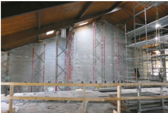
Scaffolding is being removed from sanctuary area.