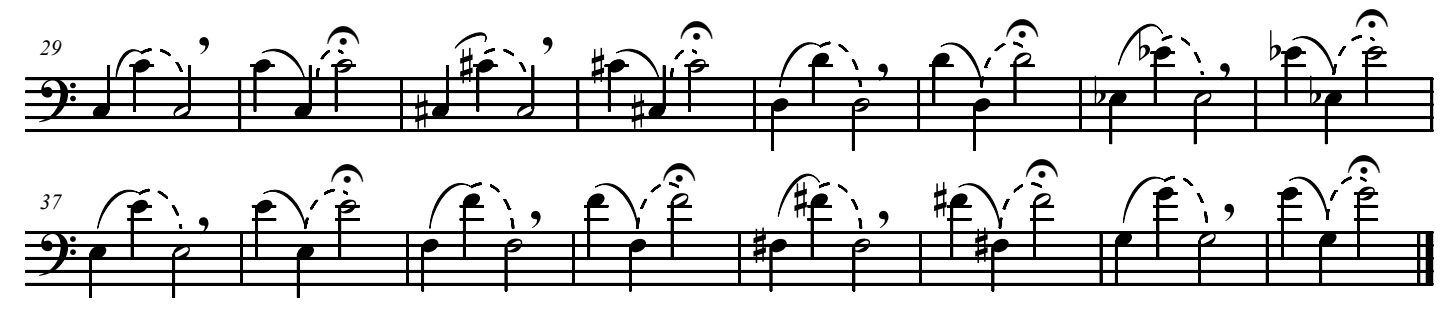
Exercise E- Buzz simple tunes.

Slur to the first note and gradually gliss to the second note. Use fifths if your range is limited.