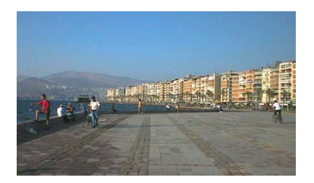
• İzmir, Alsancak

the very relaxed and laid-back atmosphere in İzmir;