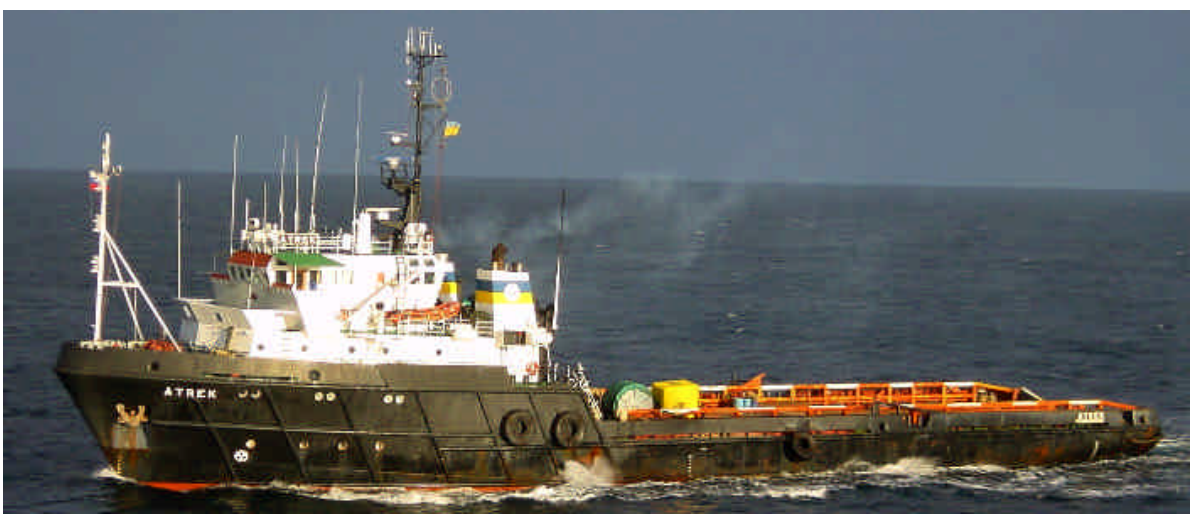
Top : the ATREK working near the Giant 4 during the Kursk recovery

Herewith we kindly inform you that AHTSv ATREK (8350 BHP, 91/103 TBP) will be available and ready to depart The Baltic area Wednesday 10th July 2002. ETA North Sea: Sat/Sun 13/14 July 2002.