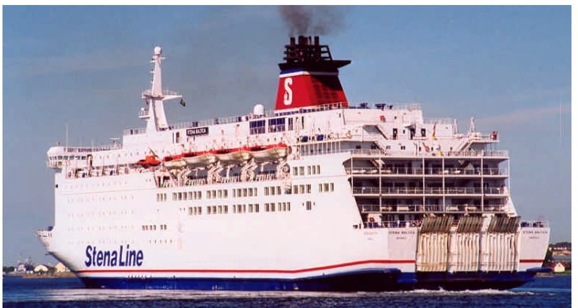
The STENA BALTICA in Karlskrona