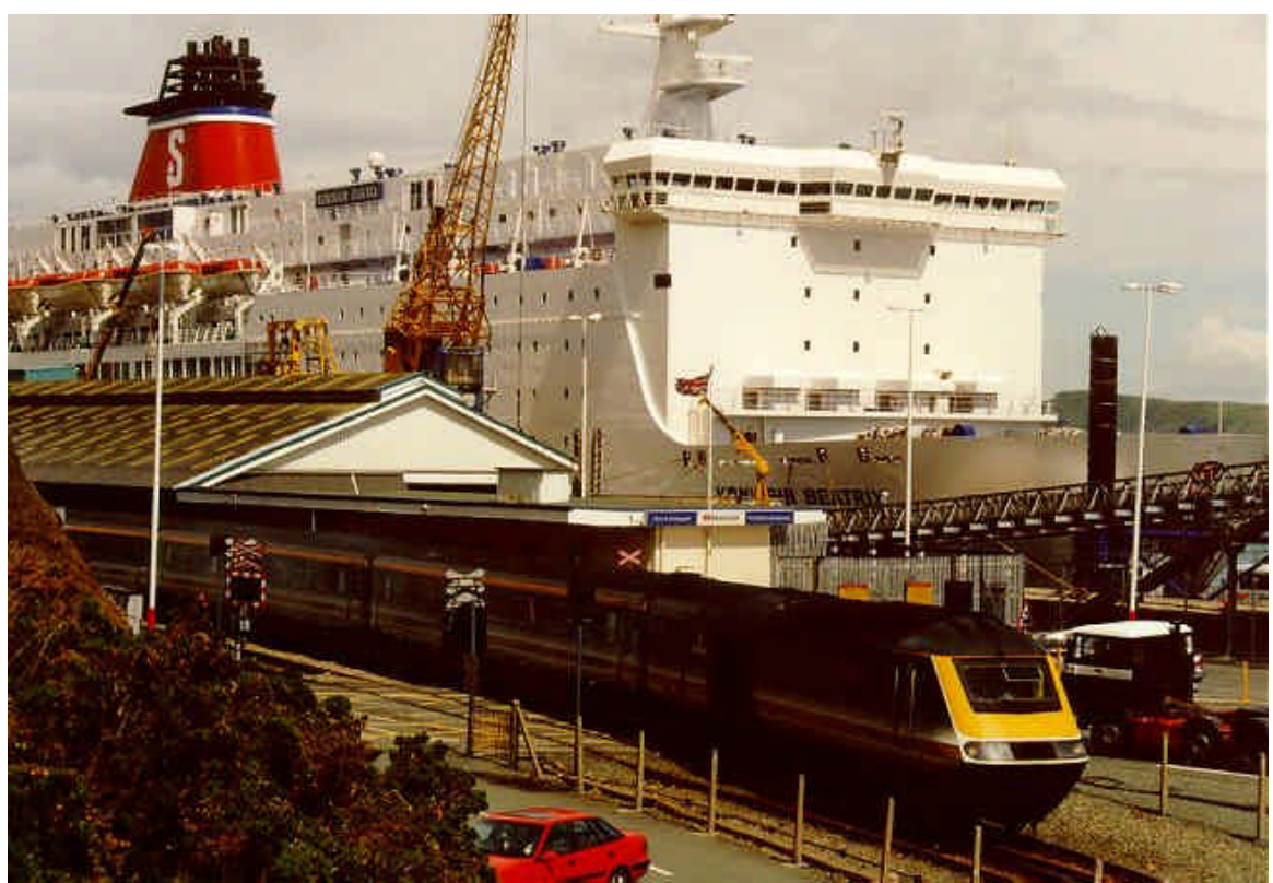
The KONINGIN BEATRIX under the STENA LINE flag.