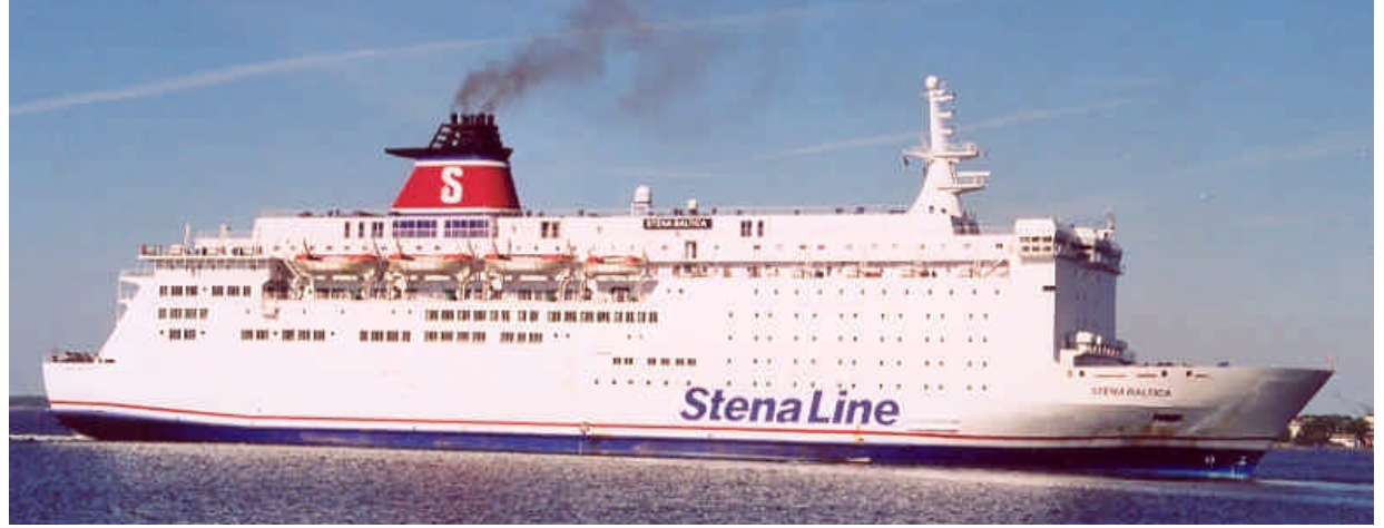
Top : the STENA BALTICA

The STENA BALTICA is well known vessel for people who have been regularly in Hoek of Holland , this ship was build under the KONINGIN BEATRIX by van der Giessen in Krimpen aan de Ijssel under yard number 935 during 1986, and ship sailed for many years between Hoek van Holland and Harwich first for the Maatschappij Zeeland , later the name changed in Crown Line and later again in Stena Line. After the vessel left the Hoek van Holland route she was transferred to the Irish sea routes on this route she kept the name KONINGIN BEATRIX .