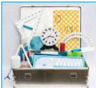
UNICEF Maths Teaching Kit: Indicative Price (Jan. 2013) 194.52 USD

Technical Specifications: Maths teaching kit packed in a metal box. Primary mathematics teaching aids kit designed for schools grade 1-6 . The primary mathematics kit consists of 23 items including instruction manuals and metal box. It is mainly for teacher's demonstration and can be used for student activities. Some consumable materials, such as paper, etc. are not included in the kit and those can be easily obtained locally and are available in other kits.