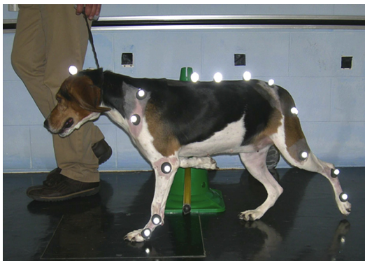
Fig. 2. A dog is instrumented with reflective markers for kinematic evaluation of gait. (From Millis DL, Levine D. Assessing and measuring outcomes. In: Millis DL, Levine D, editors. Canine rehabilitation and physical therapy. St Louis (MO): Saunders; 2014. p. 224; with permission.)

Additional information is needed regarding goniometry of different breeds and body types. Also, information regarding goniometry of various conditions and the response to rehabilitation is lacking. Furthermore, joint flexion and extension angles are commonly measured, but other accessory joint motions have not been adequately