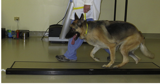
Fig. 1. A 1-year-old German shepherd dog with a partially amputated right hind limb is walking on a pressure-sensitive walkway for objective assessment of his weight distribution before receiving a prosthetic foot.

various musculoskeletal abnormalities or neurologic conditions, including hip dysplasia, elbow arthritis, and cranial cruciate ligament rupture. 32–36 Most studies have shown compensatory changes in joints and limbs as a result of a primary problem. Further, a technique known as inverse dynamics combines kinetic and kinematic gait analysis and estimates muscle moments surrounding the joints. 37–39