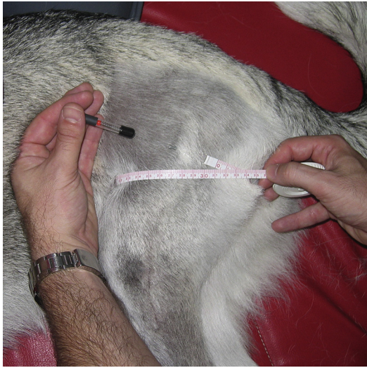
Fig. 4. The circumference of the dog in Fig. 3 is measured using a spring-tension tape measure. The circumference was 31 cm on the left (affected side, pictured) and 35 cm on the opposite side.

3.6 times greater than intraobserver variation. These results illustrate the importance of consistency when obtaining these measurements. The spring tension tape measure allows a constant end tension to be applied, eliminating subjective interpretation of how snug to pull the tape measure. In addition, specific anatomic landmarks and proper application of the tape measure can give repeatable readings between observers when using careful attention to detail. 44