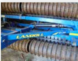
10 Landoll 3130: SUI939, 36' packer, low acres, scrapers, tandem wheels, store inside, very nice. .... $17,500(US)