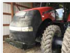
11 Case IH 315: UTP108, 1277 hrs, auto steer, front and rear duals, 4 valves, luxury cab, 18.4x46 tires. ... $149,500 (PC)