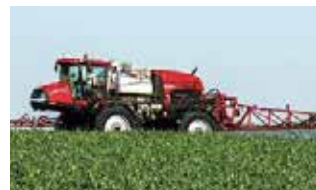
Case IH Patriot 4440: 1200 Gallon tank, 120' AIM Command Flex.