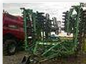
07 Great Plains UT5036: UI7670, 36' double fold, turbo blades, phoenix harrow, single basket. .... $21,000(PC)