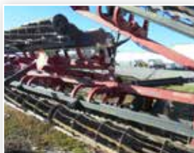
Unverferth 225: SUI937, 35' rolling harrow, with leveling harrow, baskets are 40%, but in working order. .... $6,500(US)