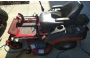
Landpride Z52 Razor: 52" deck, honda eng, rebuilt deck . . . . . (UL2480). . . . . $2,100 (PC)