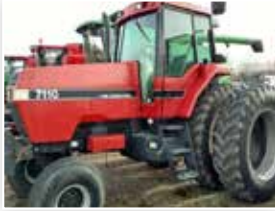
87 Case IH 7110: UT2120, 8329 hrs, 18 speed powershift, 3 remotes, 540/1000 pto, 12 weights. .... $29,800 (C)