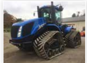
12 New Holland T9.615: UT2286, 1760 hrs, 1000 pto, 4 remotes, luxury cab, 36" belts, high idler track setup. .... $250,000 (L)