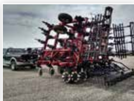
12 Salford 29RTSHD: PUI223, HD rubber torsion, individually mounted coulters, rolling & long tine harrow. ... $41,000(PC)