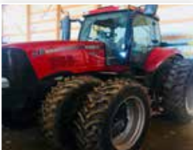
11 Case IH 215: UT6796, 2240 hrs, front and rear duals, both pto, 4 remotes, full auto steer. .... $120,000 (U)