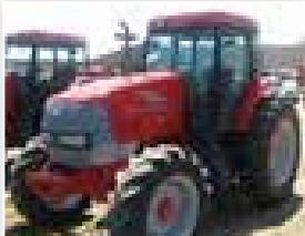
07 McCormick MTX120, TA8385, 4268 HRS, Semi Pwrshft Trans, 16X16, 4WD, 540/1000 PTO, C/H/A, 3 Rear Rem .... $34,000 (U)