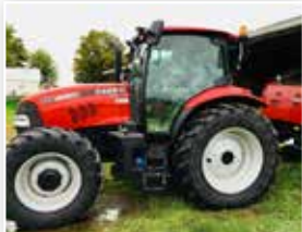
14 Case IH Maxxum 125: ut2630, 480 hrs, 4wd, 18, 4x38, 16x16 semi powershift, cab, cold weather package. .... $69,900(U)