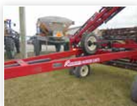
11 Remlinger DC12242AT: SUI938, Double basket, 39', field ready, baskets are 60%. .... $5,900(US)