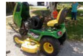
13 John Deere X730: 277 hrs, 60" deck, Liquid cooled efi, power lift (UL2459). $8,500(PC)