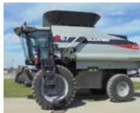
11 Gleaner S67: SUC804, 2WD, 1320 eng, 900 sep, power fold bin, variable speed header drive, HID's Duals . . . . . ..... $172,0000(US)