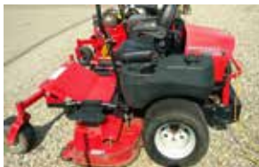
06 Gravely 260Z: 536 hrs, 27hp Kohler Command, hydraulic deck lift, 60" deck . (UL2083) $4,500 (C)