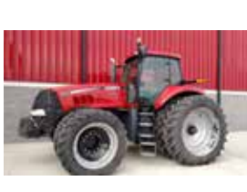
09 Case IH 335: UT4958, 3240 hrs, luxury cab, high flow, 4 remotes, autoguide ready. .... $119,000(PC)