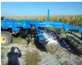
12 Landoll 2211-11: SUI849, blades in great condition, point and points excellent, 8.5-10. .... $36,000(US)