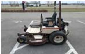
15 Grasshopper 225K: 150hrs, 61" deck, 25 hp Kohler Command, , Warranty (UL2496). . $8,300 (PC)