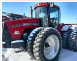
05 Case IH STX325: UT7097, 2800 hrs, 4 valves, bare back, std hydraulic pump, 18.4x42 duals. .... $88,500(PC)