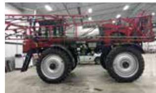
05 Case IH SPX3310: New Engine, 60/90' Boom, 20"/30" Nozzle Spacing, (PUA468) ... $94,900 (PC)