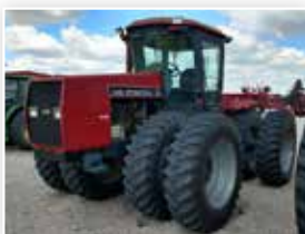
93 CASE IH 9230: PUT524, 8100 hrs, steerable front axle, 3 point, pto, 4 remotes, 18.4x38 tires, case drain. .... $39,900 (PC)