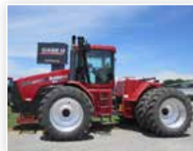
09 Case IH 385: SUT793, 1835 hrs, autoguide complete, 620 firestone tires, very nice. .... $139,000(US)