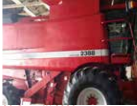
02 Case IH 2388: UC1360, 3270 ENG, 2325 sep, ft, chopper, 800 drive tires, maver ext, yield mon . . . . ..... $67,000(PC)