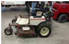
13 Grasshopper 223: 468hrs, 23hp Kohler Command, 52" rear discharge deck (UL2087) $5,300 (C)