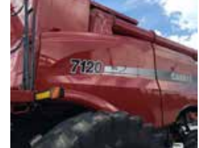
10 Case IH 7120: UC8578, 2WD, folding gt cover, duals, ext wear cone, 850 sep, 1350 sep, auto steer ready . . . . . ..... $169,000(PC)