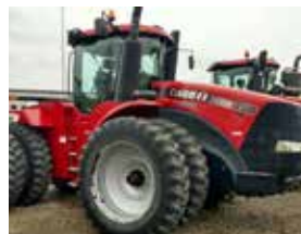
12 Case IH 350HD: UT2076, 1000 pto, 4 remotes, full autoguide, 16 spd powershift, 18.4x46. .... $170,000(C)

Check out our NEW!!! website @ evolutionagllc.com