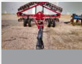
J&M TF1537: UI215 double basket, 37' soil conditioner. .... $11,900(C)