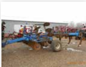
DMI Turbo Tiger: UI141, 7 shank parabolic, rear disc leveler. ... $6,000(C)