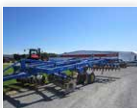
12 Landoll 2211-11: UI7291, 11 shank, 15" spacing, less than 1000 acres, 16'4" rear finish width. .... $41,500(US)