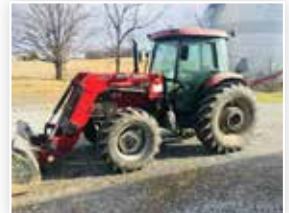
08 Case IH Farmall 95: UT1473, 2470 hrs, MFD, loader with SSL quick attach, 540/1000 pto, serviced. .... $32,500(U)