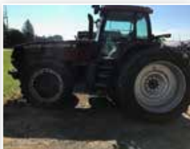
01 Case IH MX220: UT2442, 6330 hrs, rear duals, auto guidance. .... $59,500 (U)