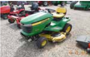
06 John Deere X324: 704 hrs, 48" deck, all wheel steer . . . . . (UL2084) . . . . $2,850 (C)