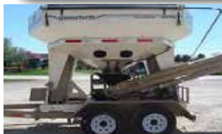
New Unverferth 2755 Seed Tender: Call for details and pricing.