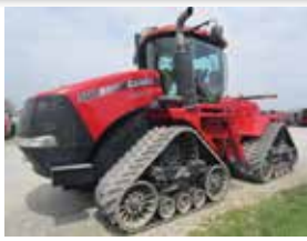
11 CASE IH 500Q: SUT821, 2620 hrs, luxury cab, 30" tracks, pto, 4 remotes, autoguide ready. .... $230,000(US)