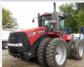
14 CASE IH 370HD: UT2101, 1250 hrs, luxury cab, 4 remotes, high capacity pump, pto autoguide. .... $215,000(C)