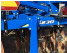
Landoll 6230-29: UI2194, 29' rock flex disc with low acreage, rear hitch. .... Call for Price(U)