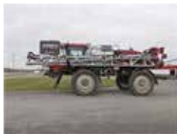
Case IH Patriot 2250: 660 Gal tank, 90' booms. Call for more details & pricing.