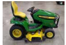
John Deere X540: 142hrs, serviced, 54" hydraulic deck and steering (UL2457) . $5,700(D)