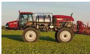
Case IH Patriot 3340: 1000 Gal tank, 120' booms. Call for more details & pricing.