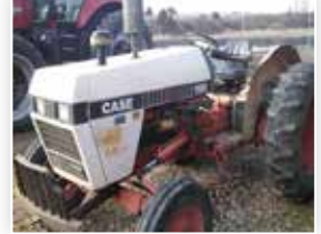
83 Case 1190: UT466, 3080 hrs, 3 cylinder diesel, 43 hp, 12 forward, 4 reverse. .... $6,900 (PC)