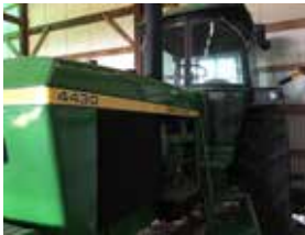
74 John Deere 4430: UT4172, 9185 hrs, complete restoration. .... $23,500 (U)