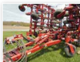
09 Krause 5635-39: SUI898, 42', rear hitch, HD shanks, low acreage, walking tandems, gauge wheels. .... $48,000(US)