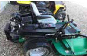
10 Bob-Cat Predator Pro 72: 340hrs, 72" deck . . . . . (UL5072) . . . . . $9,500 (U)