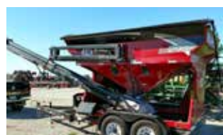
17 J&M LC290: Talc applicator wireless remote, tarp, used 3 times, scales. . . (PUI102). . . $27,800(PC)