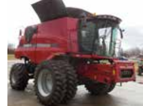
13 Case IH 8230: CUC047, shop certified, 2WD, 1067 eng, 830 sep, 40ft auger with pivoting spool, Duals . . . . ..... $245,000(C)