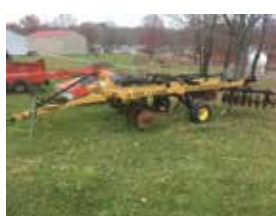
Landoll 2325-5-24: UI2295, 4 parabolic shanks, adjustable disc gangs. $7,250(L)