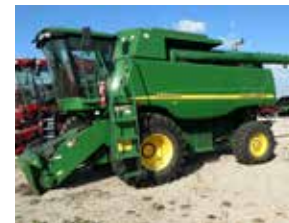
06 JD 9560STS: UC5345, 2300 sep, 3200 eng, 4WD, 30.5 drive tires, 2 owner, well maintained. . . . . ..... $87,500(PC)

Case IH 1020 20'- 30', 5 to choose from, $5,400- $18,500 Case IH 2020 30' - 35', 9 to choose from, $7,500- $13,500 Case IH 2162 35' 4 to choose from, $35,000 - $51,000 Case IH 3020 35', 3 to choose from, $24,000-$34,500 John Deere 635F 2014 $31,000