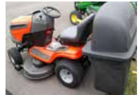
Husqvarna YTH22V46: 46" deck, 3 bucket collection system, 96 hrs (UL2456). . . $1,300(PC)