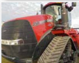
14 Case IH 450Q: SUT945, 840 hrs, PTO, autoguidance, p/s, high capacity pump, 6 remotes. .... $269,000(US)