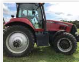
11 Case IH 190: UT2621, 910 hrs, standard cab, rear duals. .... $95,500(U)