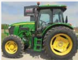
14 John Deere 6130D: SUT882, 132 hrs, loader ready, 540/1000 pto, rear weight package, deluxe cab, 18.4x38 $59,900 (US)