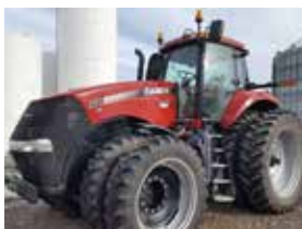
13 Case IH 370: UT9120, 1000 hrs, susp front axle, auto steer, high capacity pump, 5 valves, 30 mph $189,500(PC)