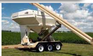
Unverferth 3755 Seed Tender: Call for details and pricing.