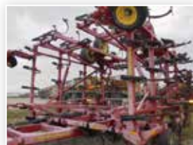
11 Sunflower 5135-38: SUI924, 38', 5 section, HD shanks, field cultivator, rear hitch, walking tandem. .... $28,000(US)