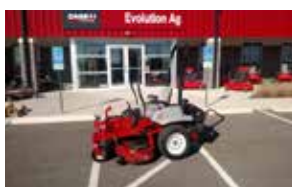
10 Exmark LZA20KAX5: 250 hrs, new deck belt and idler pulley's, 20 HP Kawasaki engine . . $4,600 (PC)