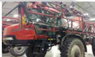
05 Case IH SPX4410: 1200 Gallon, 3980 hrs, Raven Controls, active suspension .(UA2626). $99,500 (PC)