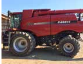
10 Case IH 8120: UC7871, duals, chopper, lt, rt, folding grain tank covers, power guide axle . . . . . ..... $169,900(U)