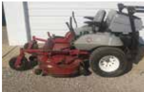
Examrk Lazer Z: 831 hrs, 29 jp liquid cooled Kawasaki, 60" deck . . . (UL2029). . . . . $5,300 (C)