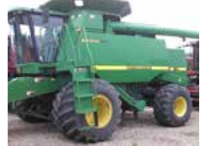
98 JOHN DEERE 9610: UC346, 4WD, SPREADER, DAM, CONTOUR MASTER . . . . . $47,000(C)