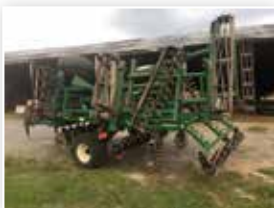
10 Great Plains 1800TC: UI351Y, blades, chopper and reel in very good shape, 18'. .... $22,900(L)