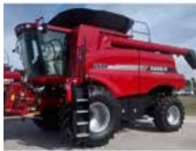
13 Case IH 6130: UC2612, singles, lt, rt, folding grain tank covers, 4WD, just coming in . Stock Photo. . . . . ..... $189,500(U)