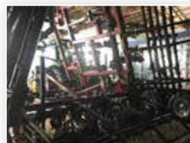
13 Salford 570: UI2622, 30', turbo blades, approximately 5,000 acres, stored inside. .... $36,500(U)