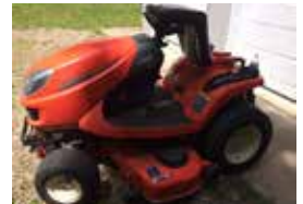
Kubota GR2000: 281 hrs, 48" deck, 4 wheel drive. . . . . (UL0417). . . . . $3,600(U)