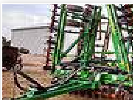
10 Great Plains 3000TC: UI250, 30' turbo chopper. .... $24,000(C)