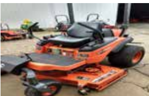
Kubota ZD326RP60: 237 hrs, 60" rear discharge deck just serviced . . (UL1329) . . . . . $8,495 (D)