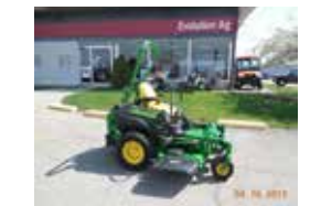
14 John Deere Z920M: 590 hrs, 60" 7 iron deck, suspension seat, fully serviced. (UL2074) . . . . $6,990 (C)