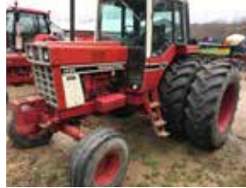
IH 1486: UT8524, nice one owner tractor, 4100 hrs, well maintained. .... $18,500 (U)