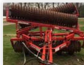
Brillion X108: UI2222, 27', good condition. .... $12,900(L)