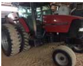
98 Case IH MX110: UT2430, 6700 hrs, 2WD, duals. .... $27,500(U)