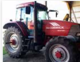
04 McCormick MTX150, UT3041, 3200 hrs, bar axles, full set of front weights, clean cab no duals. .... $42,000(U)