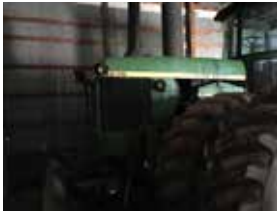
78 John Deere 8630: UT562R, 4000 hrs on 50 series motor, 3 point, 1000 pto, 3 remotes, front blade. .... $23,500 (U)