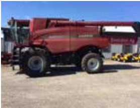
11 Case IH 7120: UUC274, 1350 eng, 975 sep hr 4WD, 2 speed, FT, RT, Pro 600, 900 tires . . . . . ..... $179,000(U)