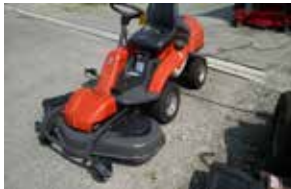
12 Husqvarna R220T: 48" out front mower deck, articulated frame, steering wheel.(UL2189) $2,195 (D)