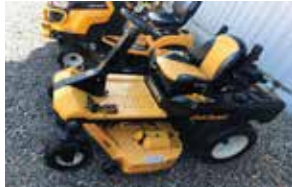
13 Cub Cadet ZF48S: 48" deck, steering wheel zero turn, 275 hrs. . . . . (UL2434) . . . . $3,950 (U)