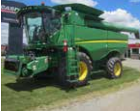
13 JD S660: SUC819, 2WD, 800 Drive tires, 855 eng, 550 sep, Goodyears . . . . ..... $210,000(US)