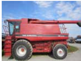
90 Case IH 1680: UC0846, 4WD, grain loss monitor, rear hydraulic chaff spreader, 30.5x32 drive tires. . . . . ..... $24,500(US)