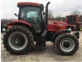
14 Case IH Maxxum 140: UT1305, 2600 hrs, multicontroller, 3 remotes, bar axle, power beyond, susp cab. .... $78,000 (L)