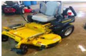
Hustler X-One: 52" deck, suspension seat, 420 hrs, serviced, Kawasaki (UL2452). . . $6,700 (PC)