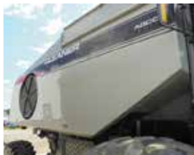
08 Gleaner R65: SUC808, 4WD, 2175 eng, 1550 sep, rebuilt 3 years ago, cdf rotor, field star system $122,500(US)