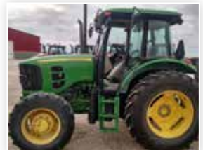
10 John Deere 6115D: UT2462, 2750 hrs, cab, heat air, new front tires, 2 remotes, nice tractor ... $36,000 (PC)