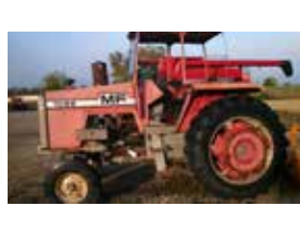
73 Massey Ferguson 1085: UT0484, 9100 hrs, 8 speed 540 pto, 1 remote, four post canopy, 16.9x38 tires. .... $6,500 (C)