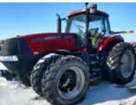
06 Case IH MX245: UT1088, 540/1000 pto, 5300 hrs, front and rear duals, complete service and new tires .... $89,500(PC)