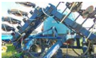
Blu-Jet AT4010: 40', 28% applicator, 1400 gal tank, 20" rows can change to 3"... (SU1900)... $15,000 (US)