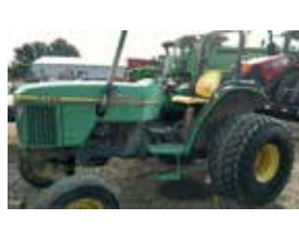
95 John Deere 5400: UT2103, 8873 hrs, 540 pto, 2wd, 2 remotes, 21.5-16.1 turf tires on rear. .... $5,900 (C)