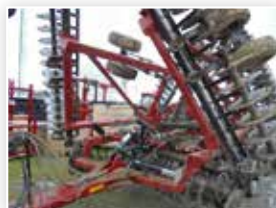
2012 Case IH 330: SUI723, 31', rear hitch, rear baskets have little wear nice machine. .... $42,500(US)