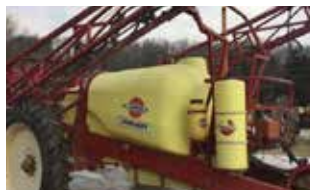
00 Hardi Commander: 80 ft booms, 800 gal tank, PTO pump. . . . . (UI2427) ... $10,500 (U)