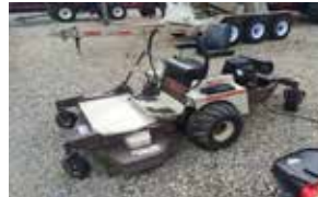
99 Grasshopper 720K: 20hp Kohler, 1356 hrs, 60" deck, bar tires. . . . . (UL2005). . . . . $3,200 (C)