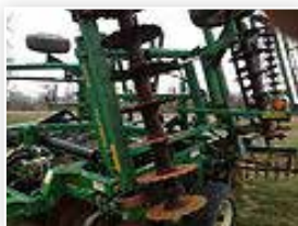
08 Great Plains 2400TT: UI27NN, 24' turbo fill. .... $24,000(PC)