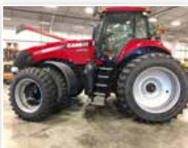
14 Case IH 235: UT8760, 390 hrs, front and rear duals, 3 pto's, powertrain warranty until 2019. .... $165,049 (PC)