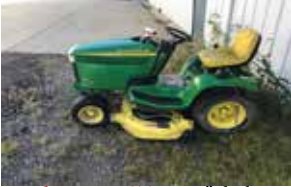
00 John Deere GT235: 54" deck, good condition, ready for spring . . . . . (UL2604). . . . . $1,100