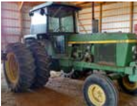
72 John Deere 4230: UT659R, 2wd, quad range trans, 2 remotes, 6 front weights ... $14,000 (PC)