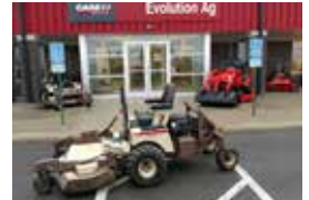
03 Grasshopper 618: 52" deck with metal collector, 18hp Kohler (UL2451). . . $3,500(PC)