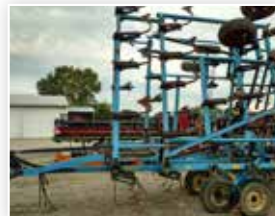
99 DMI Tigermate: UI2070, 30', 5 bar spike harrow, rear hitch with hydraulics. .... $13,500(C)