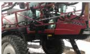
06 Patriot 4420: 2885 hrs, 1200 gal, 90' booms, Viper Pro with Raven autoguide (UA1080) .. $139,500 (U)