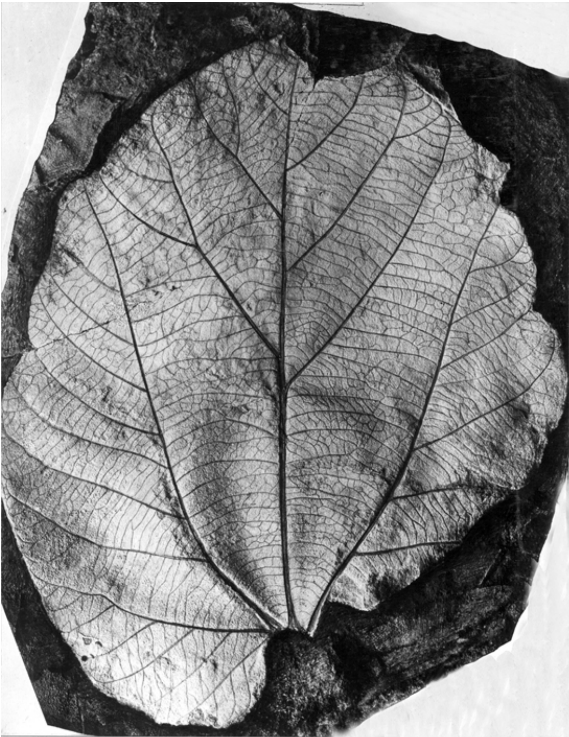
Figure 5: This leaf imprint shows a Ficus speciosissima , an angiosperm that flourished during the Cretaceous period.