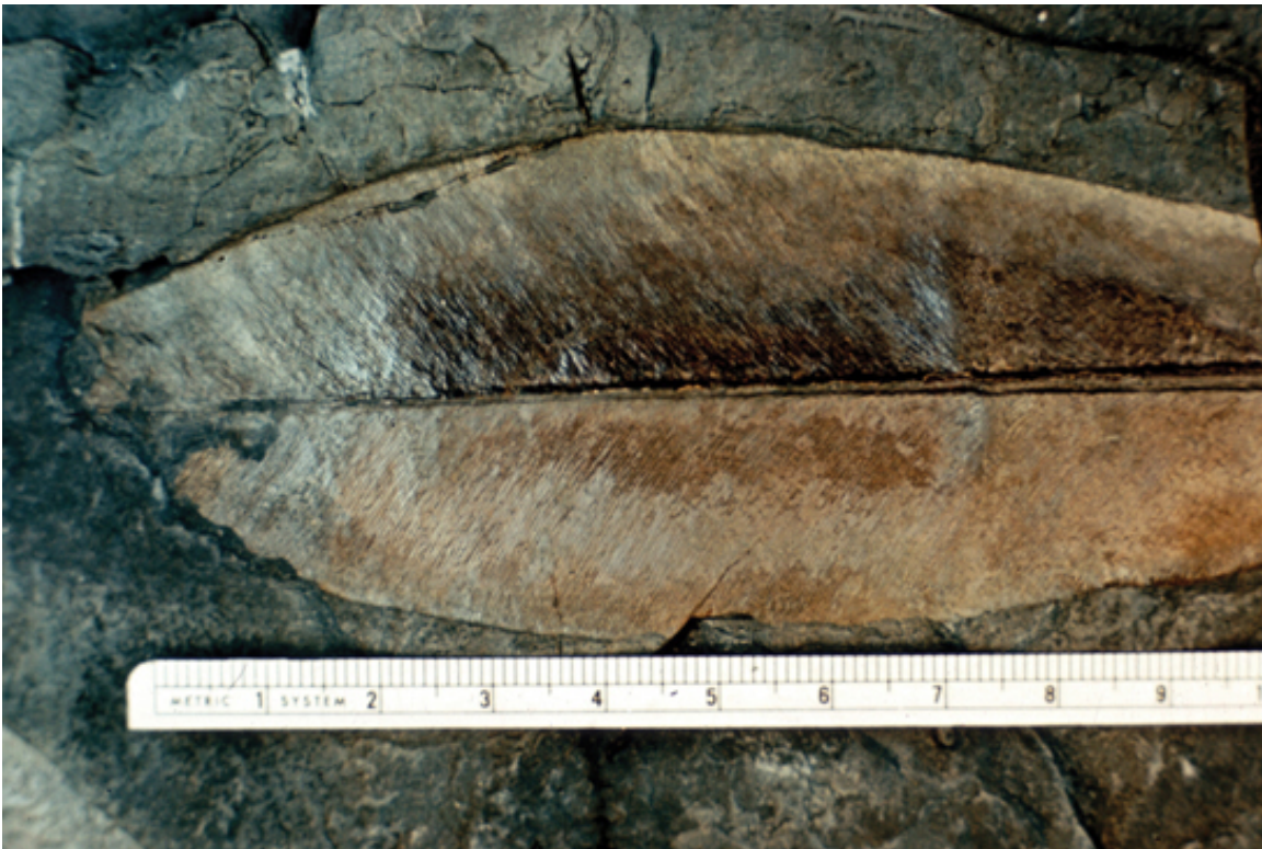
Figure 2: This fossilized leaf is from Glossopteris , a seed fern that thrived during the Permian age (290–240 million years ago).

The fossil plant Elkinsia polymorpha , a "seed fern" from the Devonian period—about 400 million years ago—is considered the earliest seed plant known to date. Seed ferns (Figure 2) produced their seeds along their branches without specialized structures. What makes them the first true seed plants is that they developed structures called cupules to enclose and protect the ovule —the female gametophyte and associated tissues—which develops into a seed upon fertilization. Seed plants resembling modern tree ferns became more numerous and diverse in the coal swamps of the Carboniferous period.