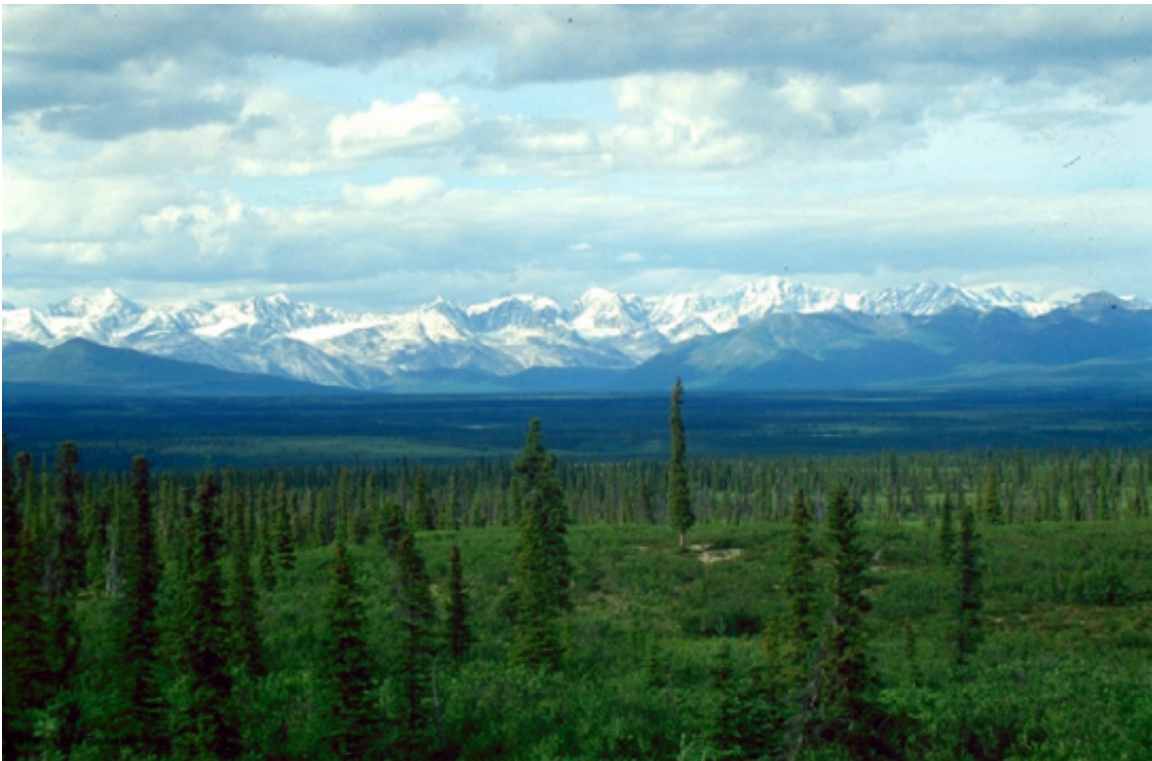
Figure 3: This boreal forest (taiga) has low-lying plants and conifer trees.

gave a reproductive edge to seed plants, which are better adapted to survive dry spells. The Ginkgoales, a group of gymnosperms with only one surviving species—the Ginkgo biloba —were the first gymnosperms to appear during the lower Jurassic. Gymnosperms expanded in the Mesozoic era (about 240 million years ago), supplanting ferns in the landscape, and reaching their greatest diversity during this time. The Jurassic period was as much the age of the cycads (palm-tree-like gymnosperms) as the age of the dinosaurs. Ginkgoales and the more familiar conifers also dotted the landscape. Although angiosperms (flowering plants) are the major form of plant life in most biomes, gymnosperms still dominate some ecosystems, such as the taiga (boreal forests) and the alpine forests at higher mountain elevations (Figure 3) because of their adaptation to cold and dry growth conditions.