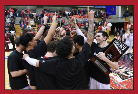
Spokane County recognized MEN'S BASKET-BALL in a proclamation for their historic 23-8 season where they were crowned the Big Sky Regular Season Champions.