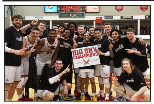
MEN'S BASKETBALL won its fourth Big Sky Conference regular season title in program history. The Eagles finished with the second-most amount of wins (23-8) in the Division I era, including a school-record 16-4 mark in conference play. They ended the season sixth in the nation in scoring offense (80.9/game) and fourth in assists (17.5).