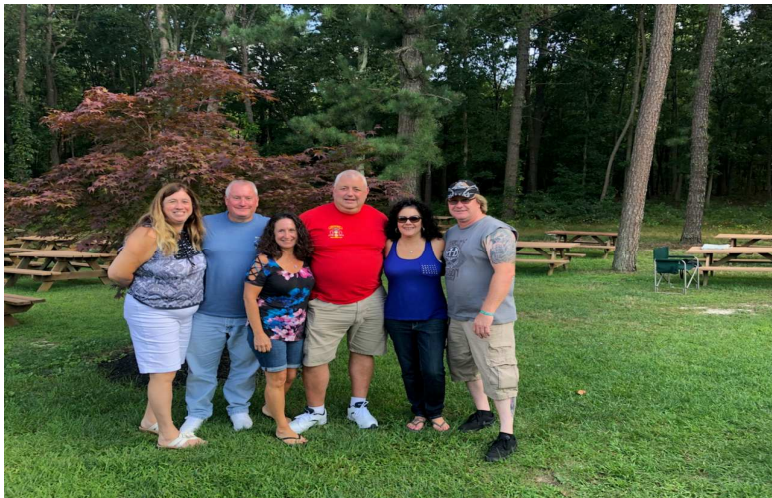
ER's having fun at Brick Lodge's Labor Day Picnic