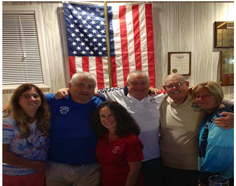
ER's getting together at Howell lodge