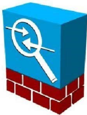
Adaptive Security Appliance

Your task is to examine the details available in the simulated graphical user interfaces and select the best answer.