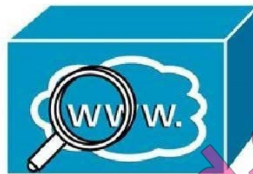
Web Security Appliance