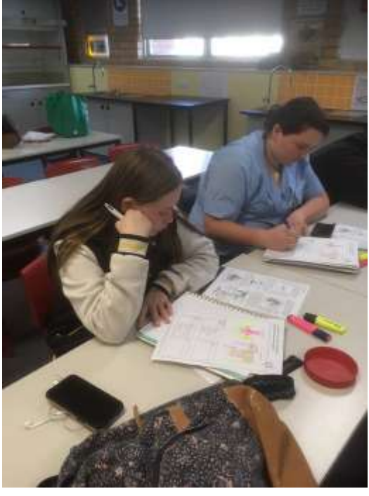
Year 12 Biology revising for their HSC Exams. Proud of you girls!