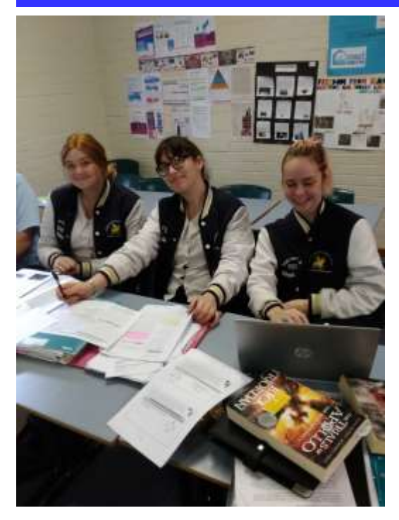
The girls hard at work in Legal Studies!