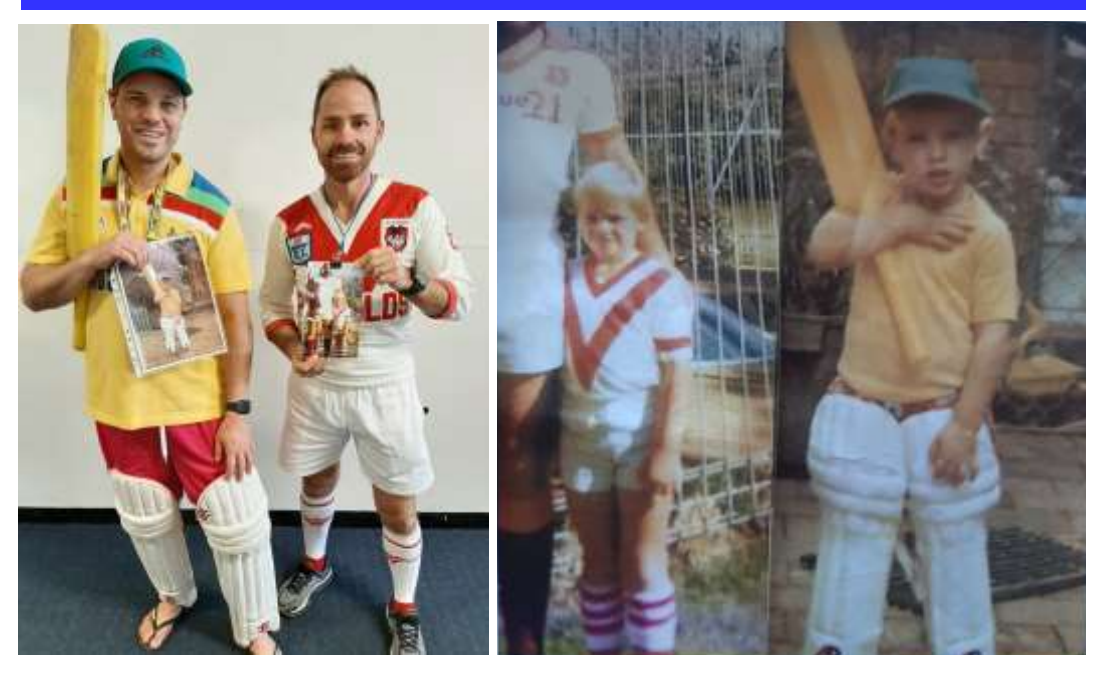
Way Back Wednesday" fancy dress theme...... Haven't changed a bit boys !!