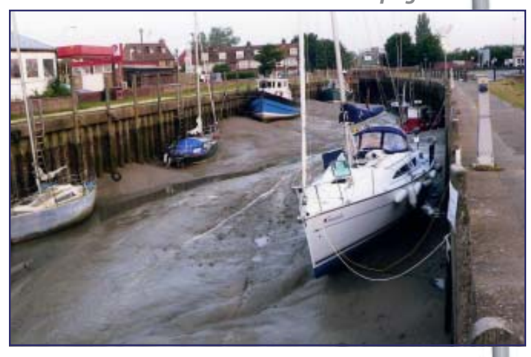
This scene was no surprise when we awoke the morning after tying up in Rye.