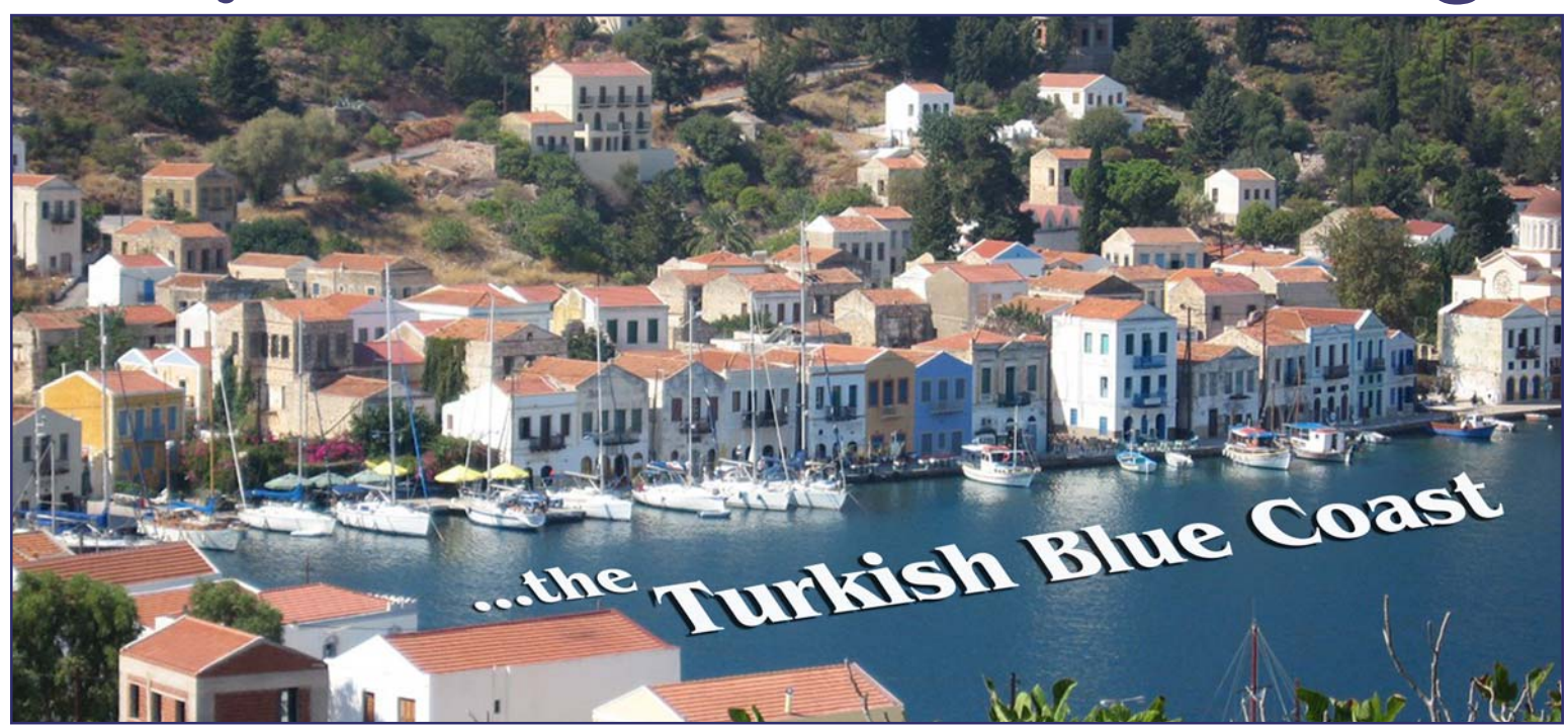
Kastellorizon harbor, with the three Swedish boats in the middle.

This year's IYFR sailing along the Turkish Riviera was unforgettable. The second week of September I sailed in our boat S/Y Surprise with family from Kos Bodrum and further to Göcek. There we rented another boat and 15 Rotary Mariners with first mates—all from Fleet the Skaw (Sweden)—sailed to (Greek), Kekova to Fineke. There some of the crew left and new