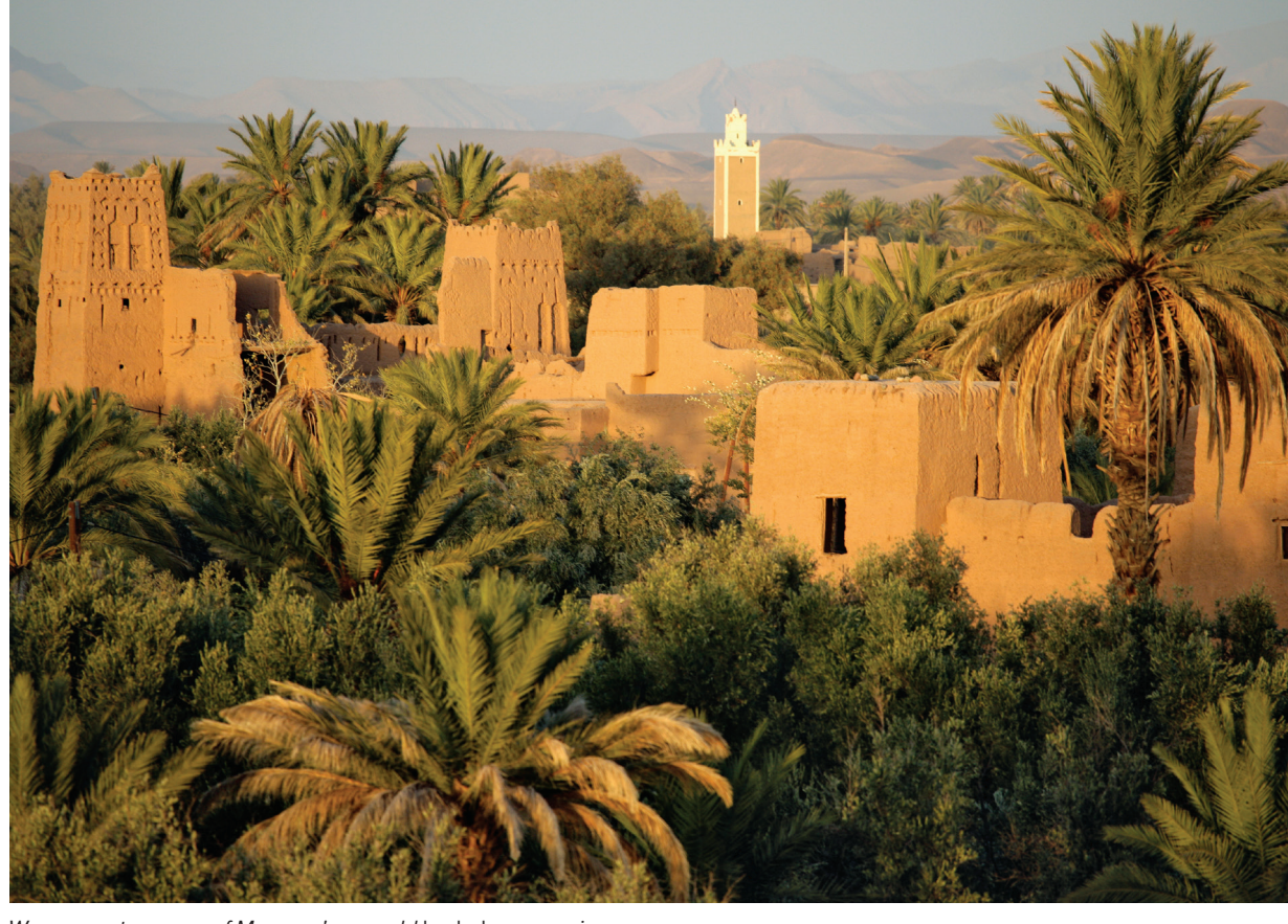
We encounter many of Morocco's age-old kasbahs on our journey.