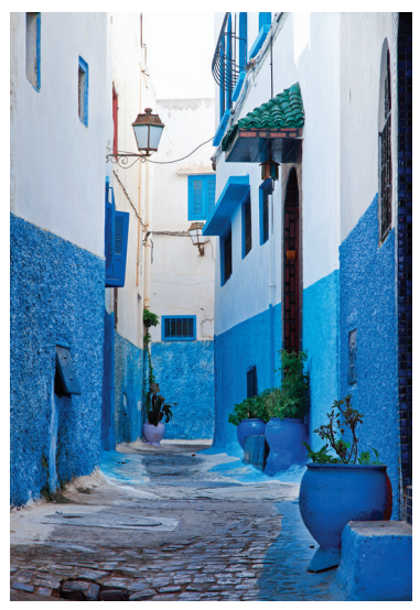
Rabat's Kasbah des Oudaias

Day 8: Erfoud/Rissani/Merzouga This morning we visit the city of Rissani, with its 18<sup>th</sup>-century ksar , a virtually impenetrable warren of alleys. We enjoy a tour highlight this afternoon as we set out on a sunset excursion to the breathtakingly beautiful sand dunes at Merzouga on the edge of the Sahara. In the enormous silence we watch the sun set over the desert as we take a camel ride along the erg . Following this experience, we'll have dinner together in this desert setting before returning to our hotel tonight. B,L,D