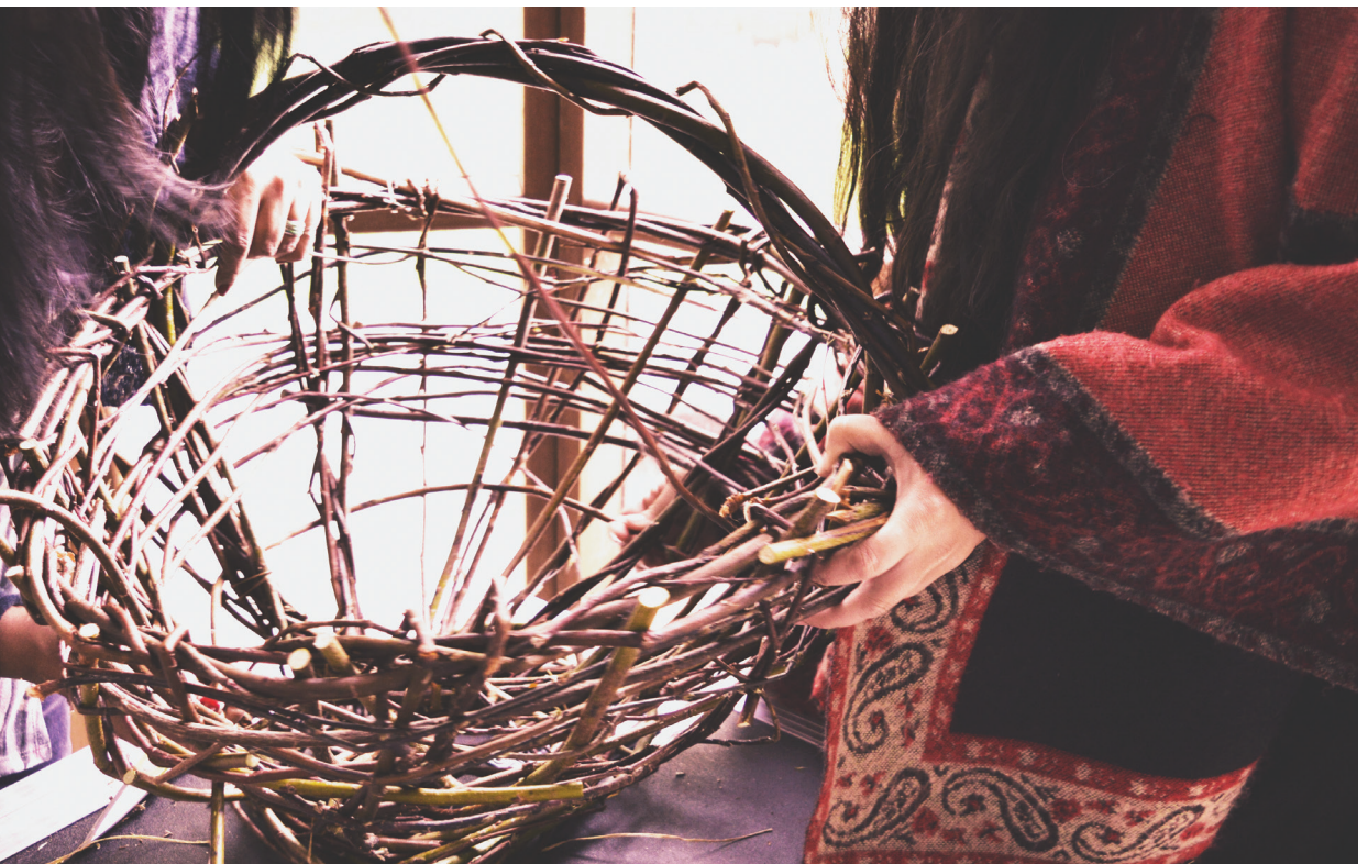
PHOTO: The National Inquiry's red willow basket.

These are no small tasks. We ask for your support, patience, and insight as we move forward with these considerations in mind.