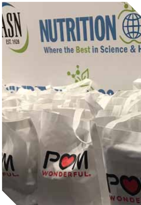
Exhibit Hall Aisle Signs $10,000

Have your company name prominently displayed on the official Nutrition 2019 tote bag. Provided to each attendee onsite, the tote bag will generate repeated visibility for the supporting company during and after the conference.