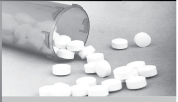
It's simple to transfer your prescriptions!

Since we are a independent pharmacy, we don't answer to a board of directorswe answer to you.