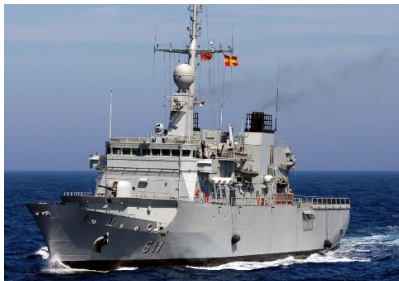
French frigate on patrol in the South China Sea, 2018.

Taken as a whole, the ongoing developments of the South China Sea appear to be teetering towards potential powder keg rather than just a series of territorial disputes.