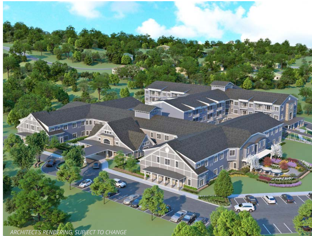
ARCHITECT'S RENDERING, SUBJECT TO CHANGE

Transportation, multiple dining venues, a well-equipped fitness center, underground, climate-controlled parking, advanced technology, empowering programs to enhance well-being, and an array of other on-site conveniences and amenities complement (and elevate) life at Artisan.