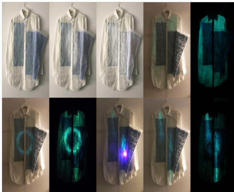
Figure 6 Textural Dynamics under different environmental conditions.

interview, is suggested. The case study aims to collect dominating qualitative and subordinate quantitative data, followed by content and statistic analyses respectively.