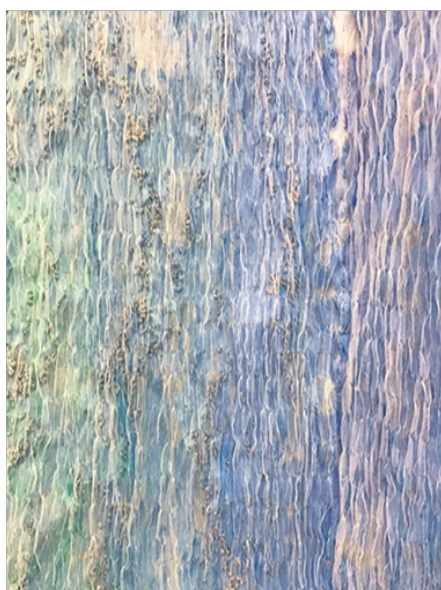
Figure 4 Dual-sensitive panel.

After considering the situational suitability, a selected initial proposal was refined by integrating the results attained in the multi-sensitive textile development process. Supported by the previous stages, the research prototyping phase was smoothly conducted with enhanced design sophistication. A dual-sensitive panel (Figure 4) was recreated with additional hand embroidery and texture enhanced layer and further applied to the critical design practice resulting in the research prototype, Textural Dynamics (Figure 5). Functioning as an in-stage implementation, the attire was cautiously designed and artfully created to give a physical form to the established idea in a balanced, pragmatic and holistic practice. Figure 6 shows the different reactive behaviors and hence the diverse appearances that the realized prototype affords. Equipped with the right exhibition setting and tools, for example, ultraviolet laser pointer, the audience is entitled a high level of user autonomy. Since the audience is able to manipulate the appearance of the attire and temporarily compose a customized signifier, a higher level of interactivity, thus, an enhanced human-artefact engagement and the corresponding user-experience are anticipated. Nevertheless, the hypothesis is to be proven by further empirical study.