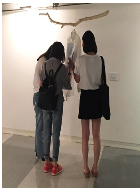
Figure 7 Audiences actively interacting with Textural Dynamics in exhibition.

The direct observation is proposed to be done simultaneously with the semi-structured interview and expert interview. The human-artefact interaction will be observed with a preset observation protocol when the subjects are presented with the realized creations. The observation foci are located on the person, objects, situation, time and activity. A questionnaire will be given to the exhibition audiences in order