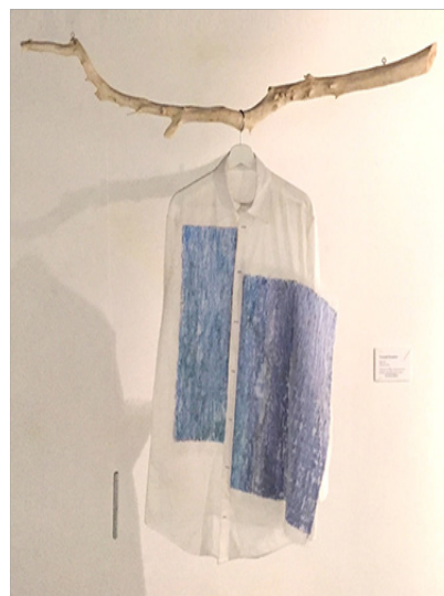
Figure 5 Research prototype Textural Dynamics.