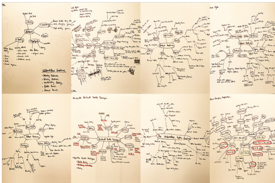
Figure 1 Mind-mapping and rapid ideation.

other, the prototyping phase was then proceeded to the secondary level resulting in a dual-sensitive swatch. 13 Step by step, the transparent polyester organza was coated with azure thermo chromic pigments and transparent-green luminescent coating on the right and wrong side respectively. The fabric was then gathered and secured by rolls of running stitches similar to the resisting mechanism of the traditional Japanese textile craftsmanship, Nui Shibori. Another layer of transparent-azure luminescent coating with higher viscosity was applied onto the surface of the gathered panel. Cracks, which allow the transparent-green luminescent coating on the wrong side of the fabric to be visible from the right side, were created on the azure thermo chromic layer along the gathers as a result of imbalanced viscosity between coatings. The hybrid swatch developed reacts to ambient thermo- and photo- stimuli and displays dynamically different visuals. The surface changes from shades of azure to light grey in contact with heat, and reacts to ultraviolet light resulting in temporary glowing surface of luminescent azure and green. Proven feasible by the secondary prototyping, the procedures and mechanism developed were adopted in the research prototyping phase.