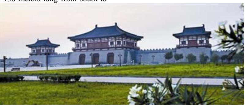
Fig. 2. Dingding Gate Ruins Museum.

Dingding gate was built in the Sui dynasty, and was called Jianguomen then. It was renamed Dingding gate in the fourth year of Wude of Emperor Gaozu (621 years). It is the east capital of Sui Dynasty and the Zhengnan gate of the west capital the Five Dynasties to Song Dynasty.