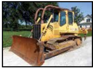
1998 DEERE 850C $58,500