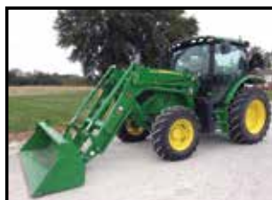
2016 JOHN DEERE 6110R $77,500