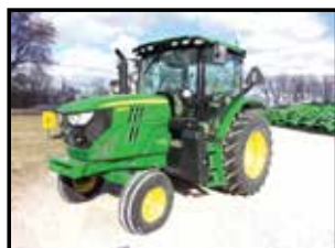
2016 JOHN DEERE 6120R $67,500