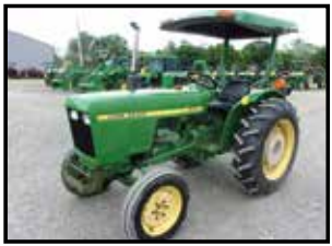
1979 JOHN DEERE 950 $5,900