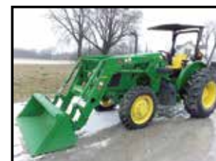
2015 JOHN DEERE 5085E $36,500