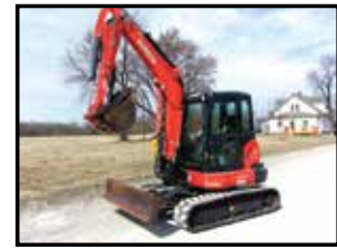
2016 KUBOTA KX057-4 $52,500