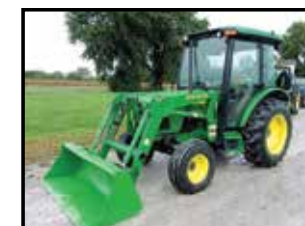
2002 JOHN DEERE 5320 $26,900