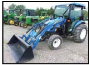
2010 NEW HOLLAND BOOMER $31,900