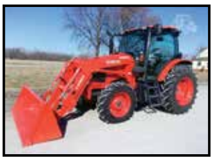
2018 KUBOTA M6-111 $68,900