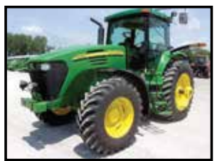
2005 JOHN DEERE 7720 $69,500