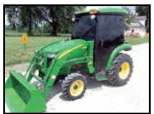
2007 JOHN DEERE 3720 $26,900