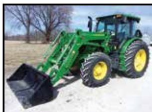
2016 JOHN DEERE 6105E $58,500