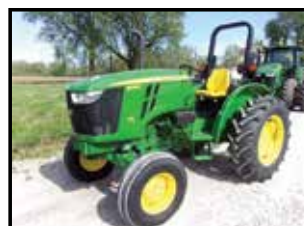
2016 JOHN DEERE 5055E $15,900