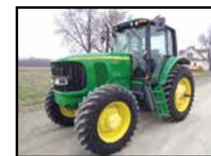
2003 JOHN DEERE 7420 $74,500