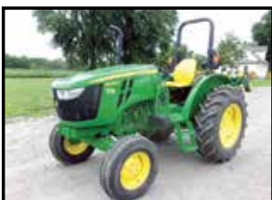
2018 JOHN DEERE 5045E $16,500

Check out our complete inventory @ www.bnctractor.com