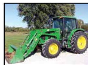
2011 JOHN DEERE 6330 $61,500