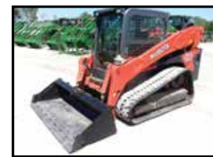
2017 KUBOTA SVL95-2S $49,500