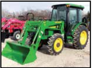
2002 JOHN DEERE 5420 $42,900