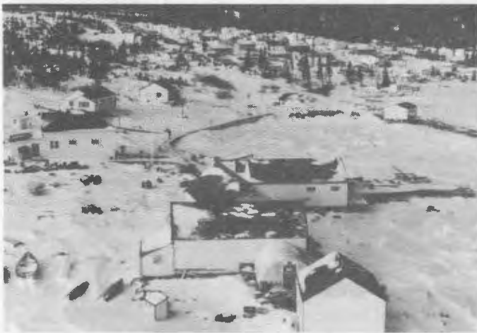
Premises at Rigolet, 1970s