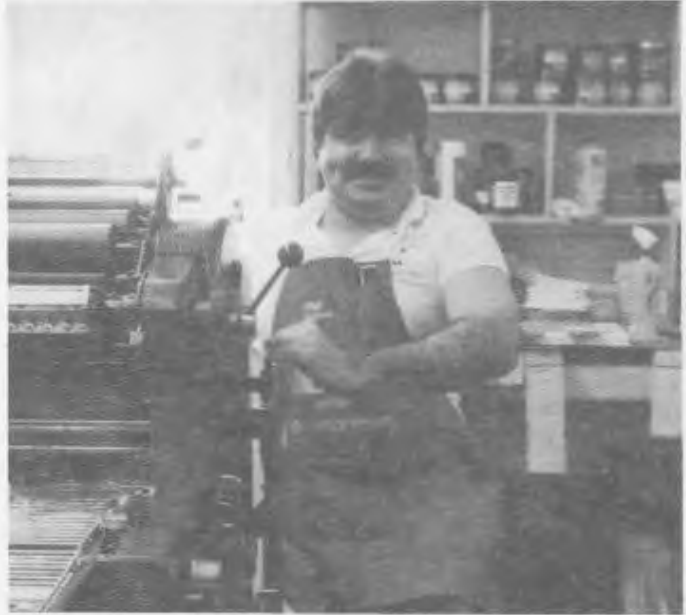
The HUB print shop

ferred by the HUB, it has also acted as an advocacy organization for the disabled. It was a founding member of the Recreation Advisory Council for Special Groups, assisted in the organization of the 1978 Canadian Games for the Physically Disabled, and was involved in the development of the rehabilitation certificate program through MUN Extension.