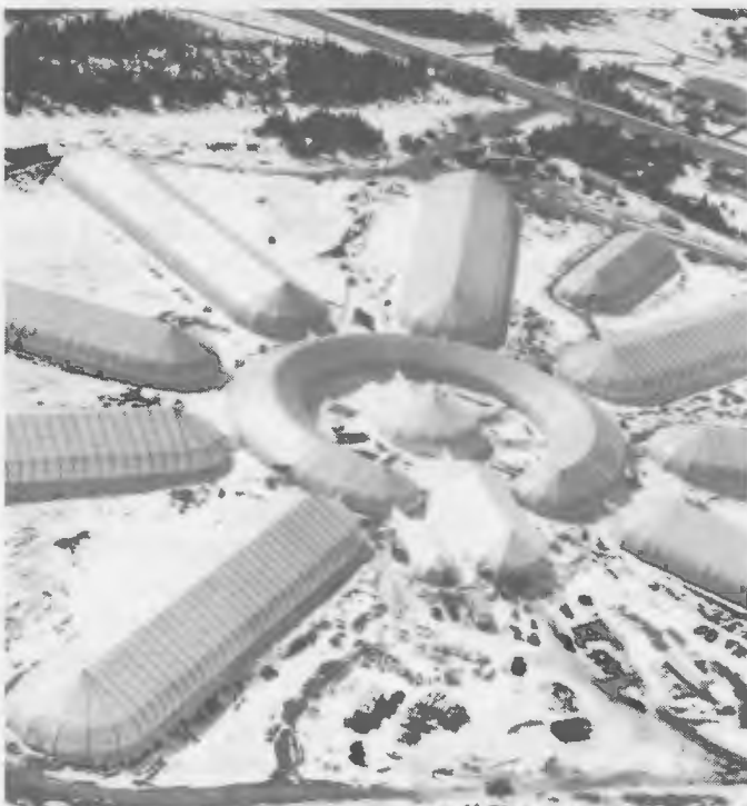
Aerial view of the Sprung greenhouse

Fillmore and Sandilands (1983), D.C. Nutt (1952), ET (Dec. 18, 1990). GMW