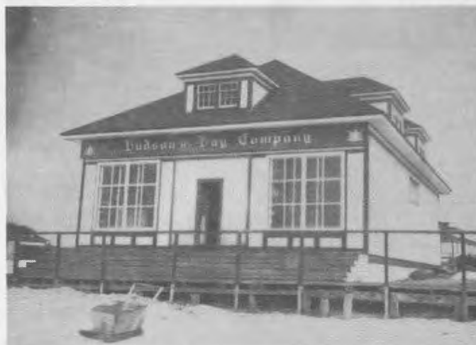
Store at North West River, 1950

By 1870 there were nine trading posts in Labrador, in addition to several outposts and seasonal fishing stations. North West River was generally profitable and the hub of a variety of activity, including salmon