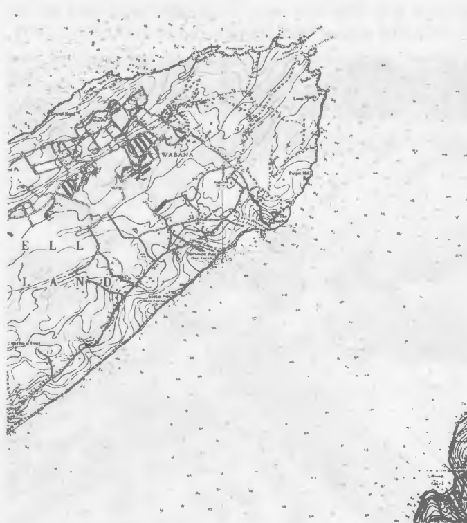
Modern hydrographic chart of Conception Bay, showing part of Bell Island

In 1962 the C.H.S. commissioned a new vessel, the Canadian Survey Ship Maxwell , to survey the Atlantic region. It remained in service until 1990 and produced three new charts of Newfoundland every year. By the time the Maxwell was retired about one quarter of C.H.S.'s 1,050 charts were of Newfoundland waters. The vessel was replaced by the Matthew — the name of Cabot's vessel on his 1497 voyage — which in addition to its survey work was also given the tasks of oceanographic research and fisheries surveillance. Al-