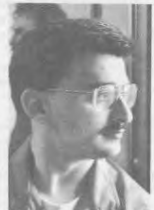
Former Mount Cashel resident testifying

The daily proceedings of the inquiry were recorded and broadcast on a local cable television channel. Media coverage was also extensive, with CBC, CTV and Global television reporters, along with reporters from several large Canadian newspapers, attending the inquiry almost every day, especially in the initial phase when former orphanage residents, government officials and police officers testified. Public awareness of the inquiry was so extensive that lawyers for Christian Brothers charged with sexual assault attempted to limit the scope of the evidence provided by former Mount Cashel residents on