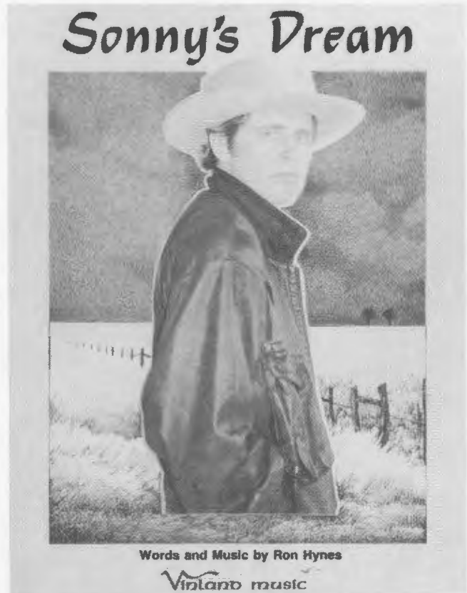
Sheet music for "Sonny's Dream"