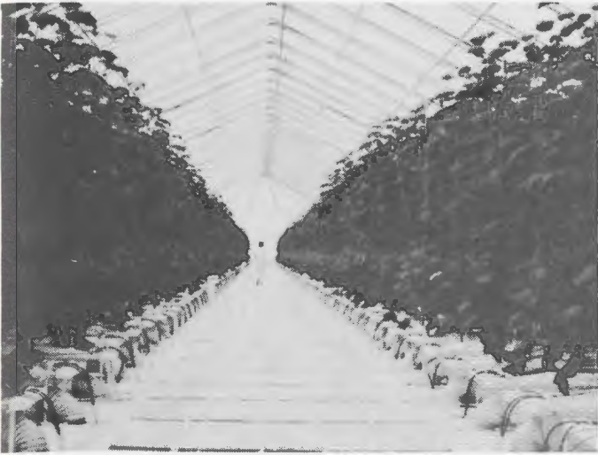
Interior of the Sprung greenhouse

Sprung qv established a business in Mount Pearl to grow cucumbers commercially using the flooded-trough method. The Sprung greenhouse experienced numerous difficulties and the enterprise was abandoned in 1990. Growing crops under a shelter in northern climates incurs tremendous heating costs. In Iceland geothermal heat is used, while in some countries the waste heat of electric generation plants and of other industries is used. PETER J. SCOTT