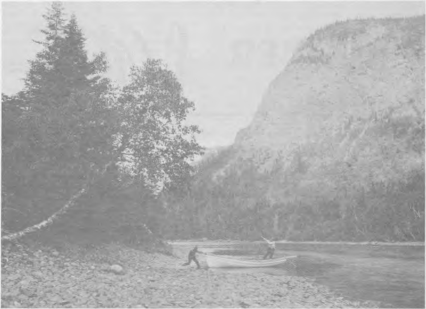
Boating on the Humber, early 1900s

HUMBER RIVER. From headwaters near Western Brook in the Long Range Mountains the Humber River flows southeast into the Birchy Basin and then turns southwest to flow into the Bay of Islands near Corner Brook. The drainage area covers about 160 linear kilometres, giving a total watershed area of 8,100 km 2 and making the Humber River the second largest in insular Newfoundland. Its drainage exhibits geologic features from the Mississippian, Ordovician and Cambrian periods and has rock types from sedimentary to intrusive volcanics.