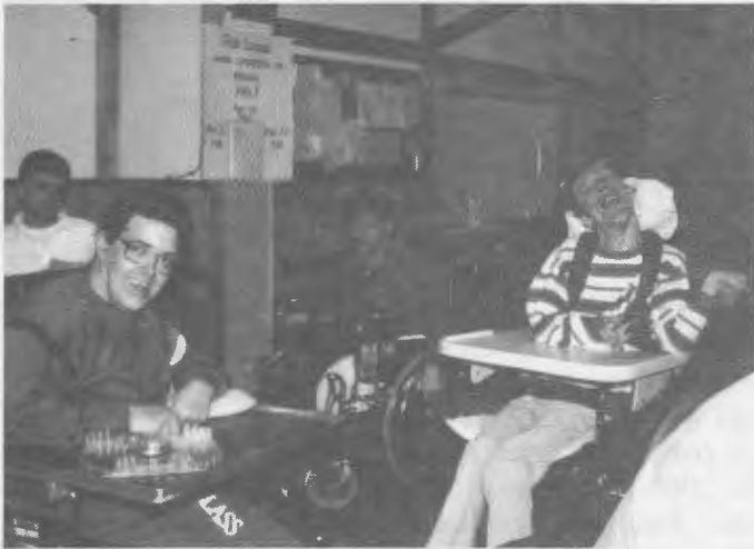
Social at the HUB