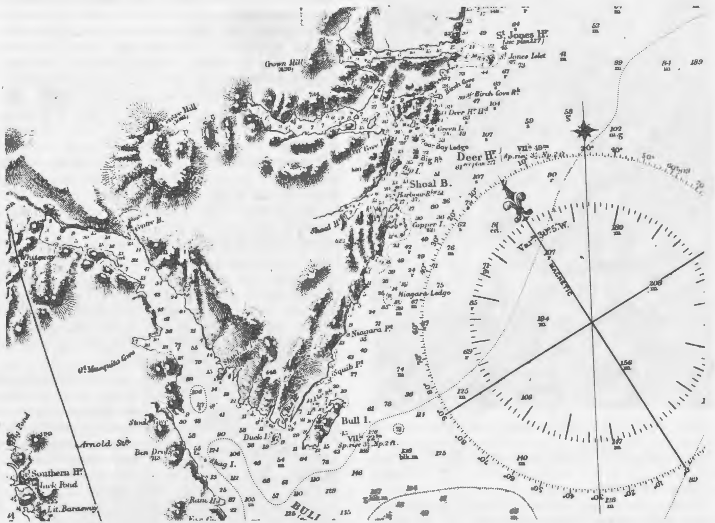
Part of a 1879 chart of Trinity Bay

though the Matthew was originally stationed in St. John's, the vessel was transferred to Halifax in 1991.