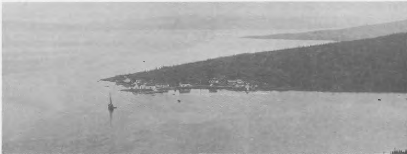
The HBC post at Rigolet, early 1900s