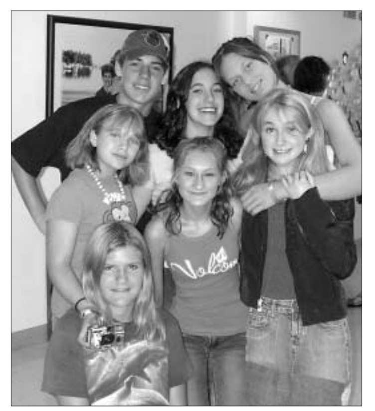
FA teens and friends enjoying each other's company.

"Love to be here, educational and exciting. Good to see other parents and kids struggling with the same things as yourself. It made us happy, too, in the way that there are so many people helping and supporting patients with FA. The volunteers are exceptional and so is the Camp Sunshine staff!"