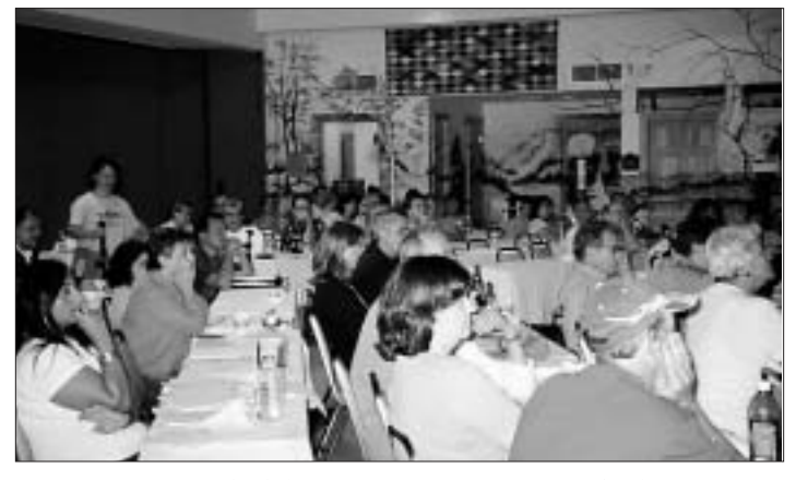
FA parents and adults pay rapt attention to a medical presentation.