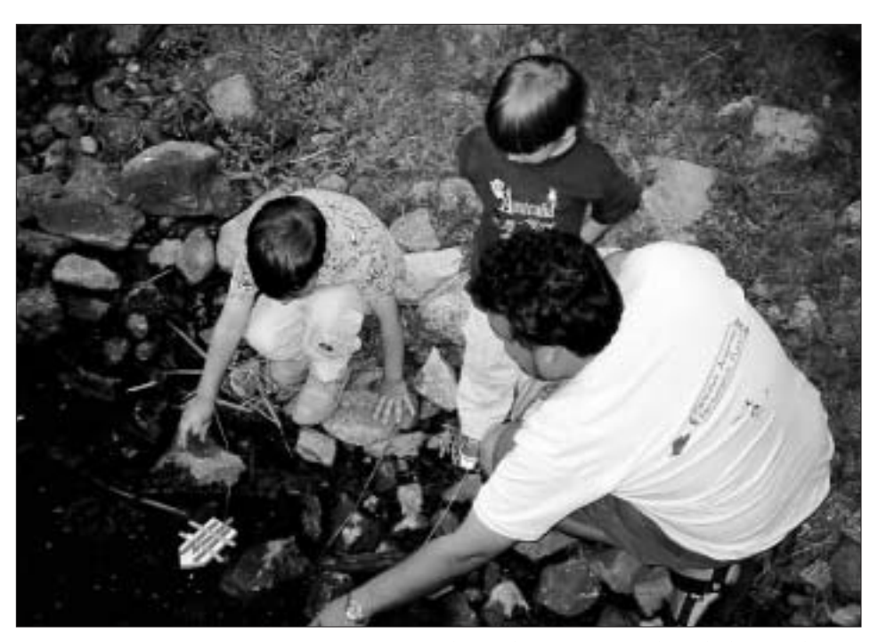
Father and sons prepare to launch their Wish Boat.