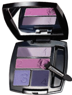
True Color Eyeshadow Quad

4 expertly paired shades, numbered for easy application. All-day crease-proof wear.