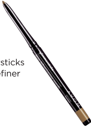
Glimmersticks Brow Definer

Waterproof, color-dense, retractable brow pencil.