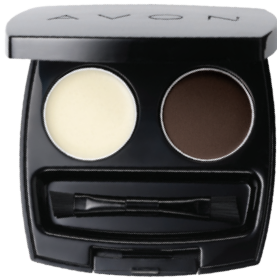
Perfect Eyebrow Kit

Fills in brows, and forms and sets brow shape.