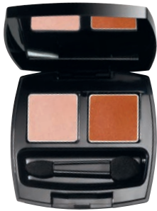
True Color Eyeshadow Duo

Rich, true color from a duo of expertly paired shades. Lasts all day without creasing.