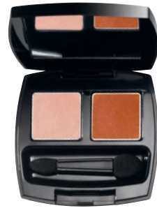
AVON TRUE COLOR Eyeshadow Duo

Rich, true color from a duo of expertly paired shades. Lasts all day without creasing.