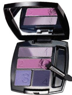
AVON TRUE COLOR Eyeshadow Quad

4 expertly paired shades, numbered for easy application. All-day crease-proof wear.