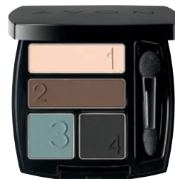
AVON TRUE COLOR Matte Eyeshadow Quad

4 expertly paired matte shades, numbered for easy application. All-day crease-proof wear.