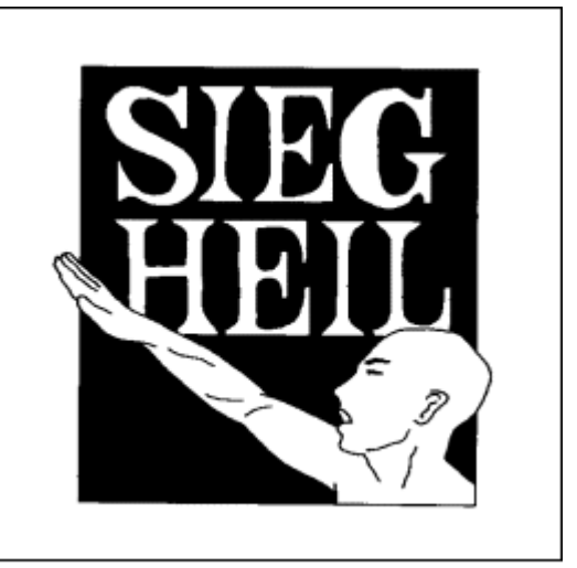
Insert: Mirroring the practices of Hitler's Nazis, raising an outstretched hand and saying "seig heil" ("hail to victory") is a Nazi salute still used by modern day racists.