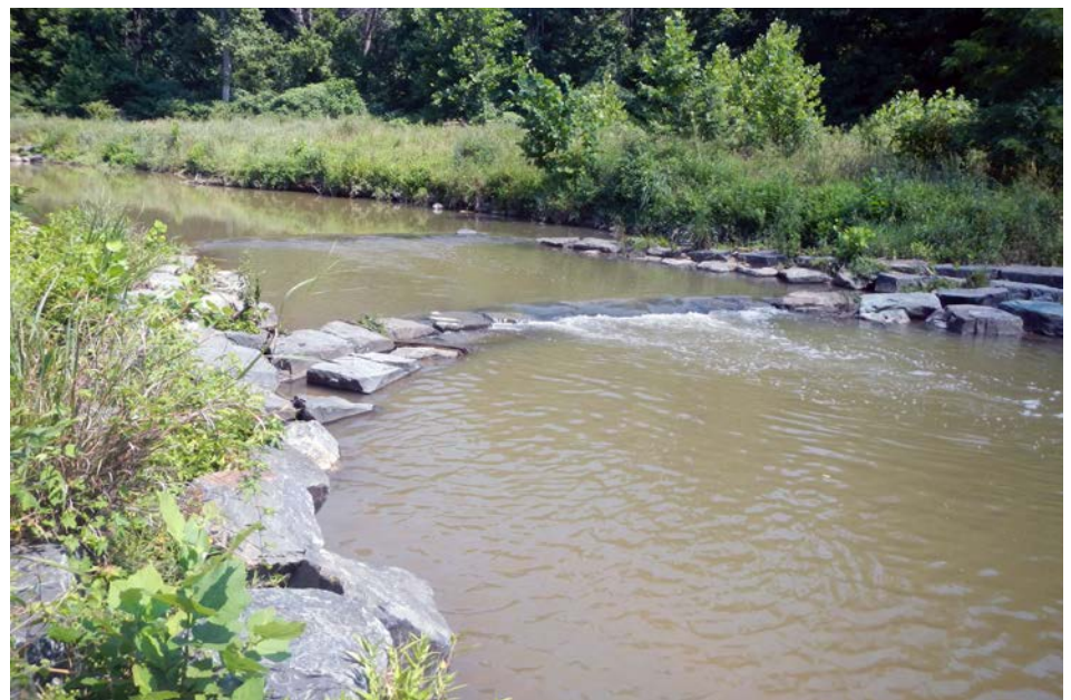
Figure 4. A-vane, Paint Branch, College Park, Maryland.

Even though rocks may be sized correctly for the design flow, individual rocks may be dislodged due to turbulence around exposed rocks or flow between rocks. All rocks used in a cross vane should fit together snugly (Figure 4). Offset vane rocks from footer rocks such that each vane rock is centered on the intersection