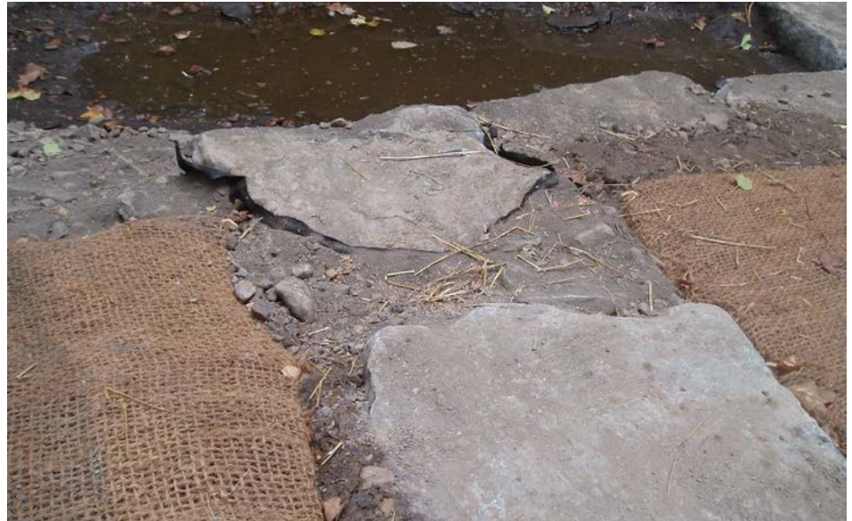
Figure 5. Vane rocks should fit snugly together and be chinked with smaller rock with a wide range of sizes. (Design by Wetland Studies and Solutions, Inc.)

Consider requesting help from local conservation or volunteer-based organizations for monitoring work that can be performed by laypeople, if resources for monitoring are unavailable or limited.