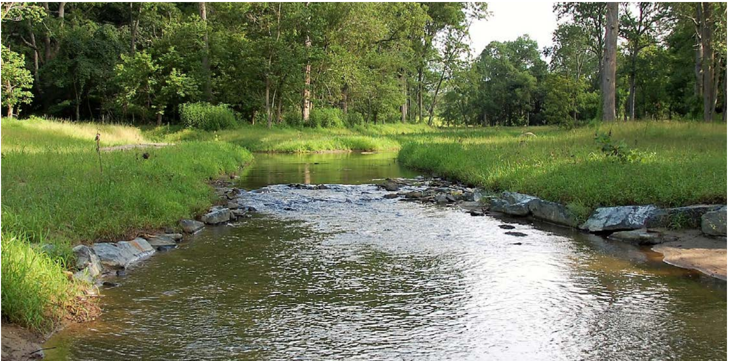
Figure 1. Cross vane on Upper Little Patuxent River, Maryland used to protect a sewer line which crosses the channel just upstream of the vane.