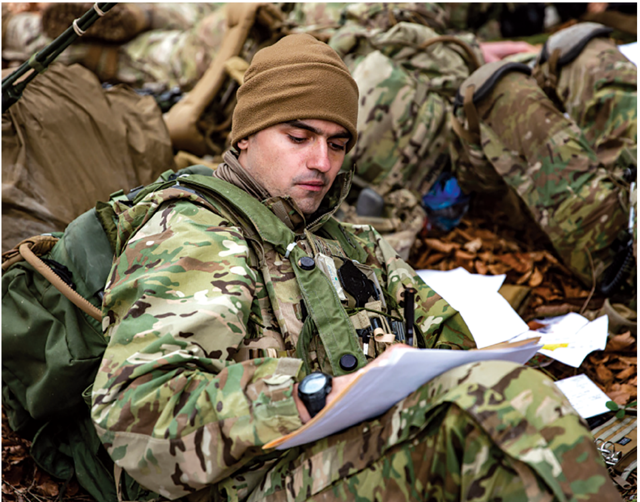
A paratrooper assigned to 2nd Battalion, 503rd Parachute Infantry Regiment, 173rd Airborne Brigade, takes some time to plan for an upcoming training event 11 March 2021 as part of Exercise Rock Topside II at the Joint Multinational Readiness Center in Hohenfels, Germany.

In the second column, planners state the factor's impact on the operational environment (often negative but can also be positive). This is the "so what," where judgment and evaluation first come into play. Each factor can have several associated deductions. One way to frame and identify possible deductions is to apply the PMESII framework by asking how this factor influences the operational environment within each of the PMESII domains. (Depending on the level of war and particular planning process used, other appropriate frameworks may be applied.) If using PMESII, for example, this could generate a minimum of six deductions per factor, but then again, each factor may or may not impact each domain. Similarly,