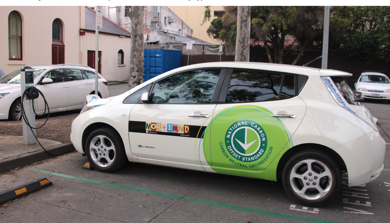
Figure 5: One of Moreland City Council's electric vehicle charging points.

City of Moreland installed Victoria's first electric vehicle charging station.