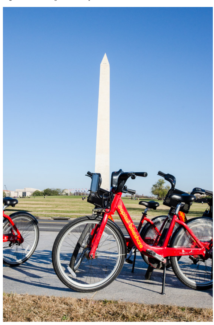
Figure 4: Washington DC Capital bike share scheme.

13% walk and 4% ride (Alliance for Biking and Walking 2016). These shares are significantly higher than the average mode shares for Australian cities - 14% by public transport, 3.8% walk and 1.3% ride on average (Australian Government 2013).