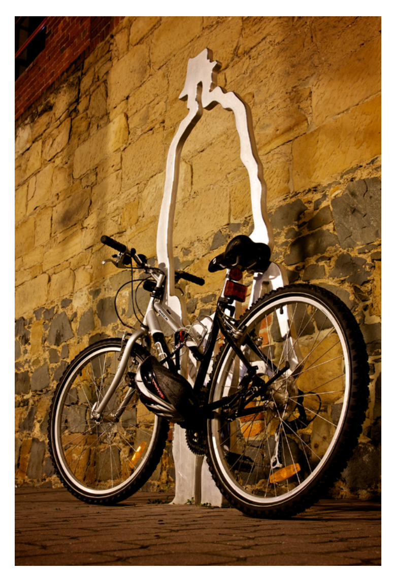
Figure 7: "Charlie the Bike Rack" Hobart City Artbikes.

Hobart City Council (City of Hobart 2017) also supports "Artbikes" - a series of free bicycles available to ride around Hobart, and bike parking facilities at key cultural and art institutions. The bicycles come with free helmets, locks and a map (Figure 7).