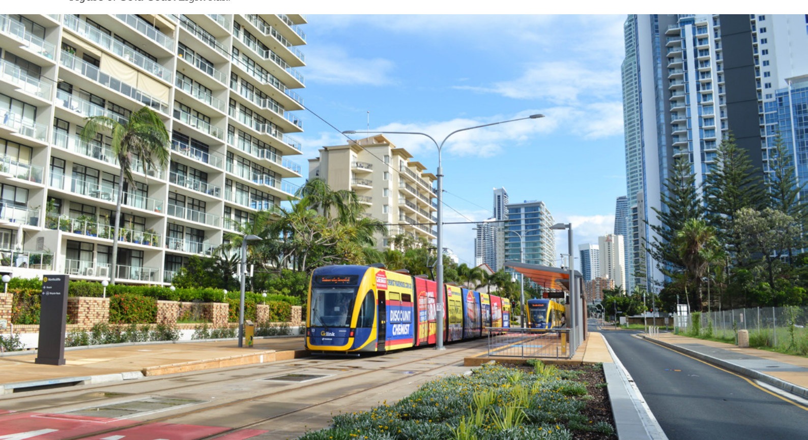
Figure 6: Gold Coast Light Rail.

In addition to the benefits of improved public transport access for Gold Coast residents and visitors, research has found that the new light rail has increased property values near the project (Bourke M 2017).