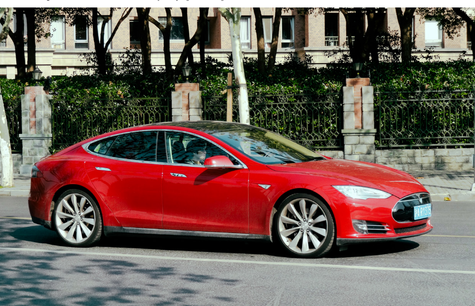
Figure 3: Electric cars run on electricity and plug-in rechargeable batteries.

Electric vehicles powered entirely on renewable energy are practically zero emissions.