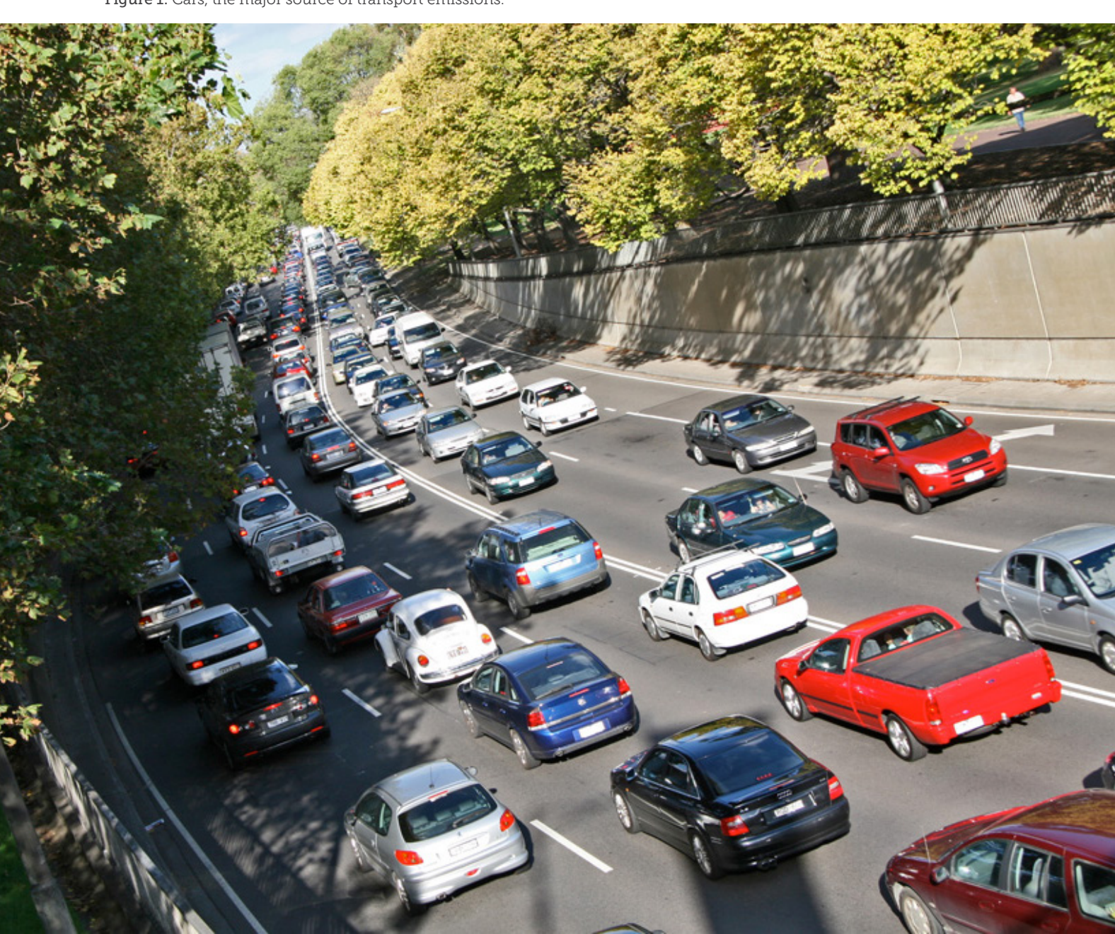
Figure 1: Cars, the major source of transport emissions.

Collectively, cars in Australia emit the same as Queensland's entire fossilfuelled electricity supply.