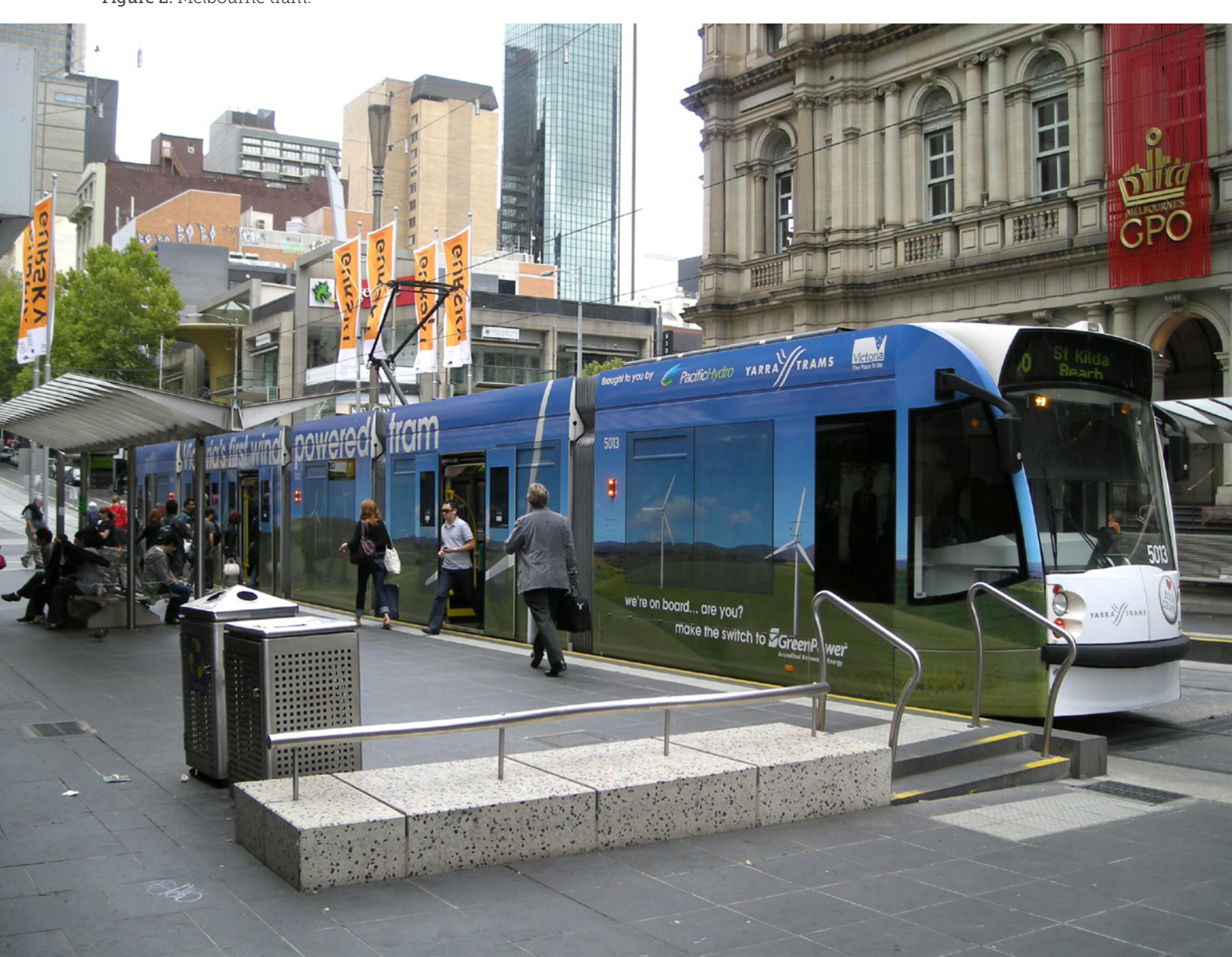
Figure 2: Melbourne tram.

Directing investment to new public transport can drive a high shift away from car use and dramatically reduce greenhouse gas emissions.