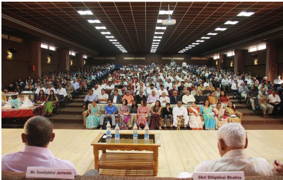
Audience present at Naming ceremony of FETR