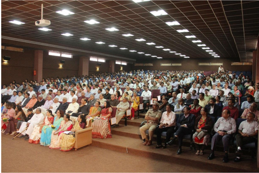
Audience present in Inauguration ceremony at FETR Auditorium