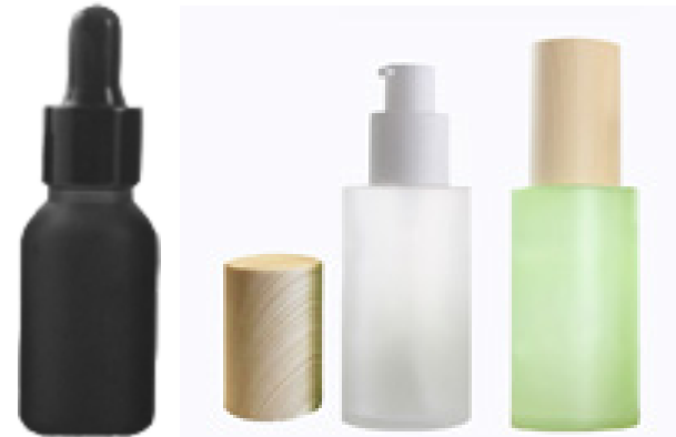
CBD Oil, Serum, Lotion