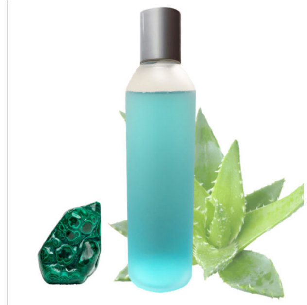
8 fl oz / 240 ml Clear Light-blue Liquid