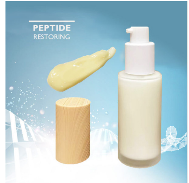
1.7 oz / 50 g Light-yellow Lotion