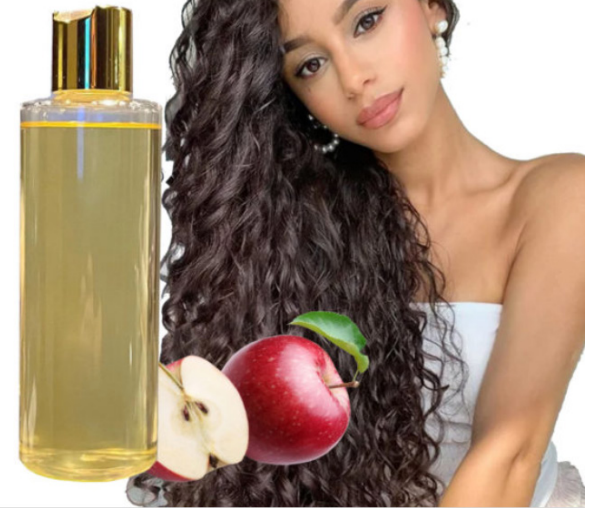
Apple Cider Vinegar SHAMPOO