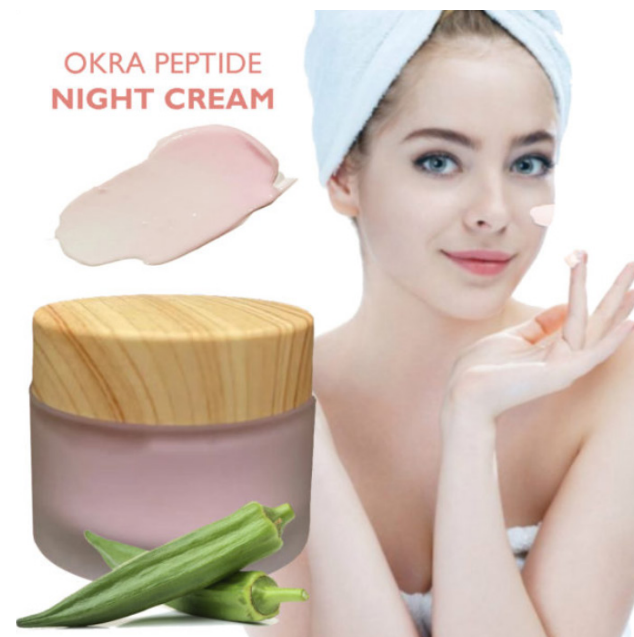
1.7 oz / 50 g White or Light-yellow or Pink Cream