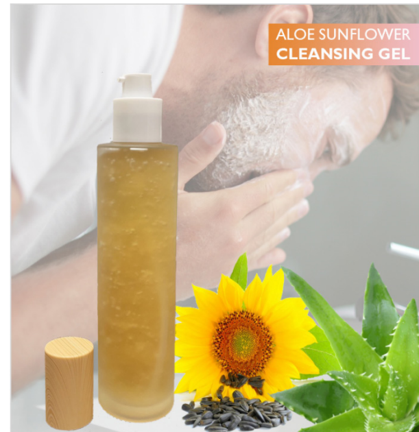
4 fl oz / 120 ml Clear Light-yellow to Yellow Gel