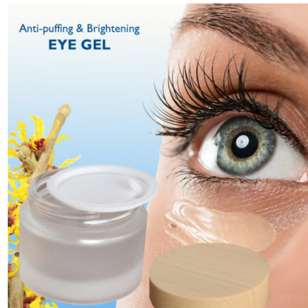
0.5 oz / 15 g Clear Colorless to Light-yellow Gel