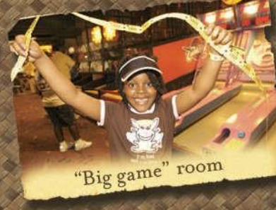
"Big game" room