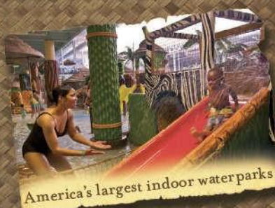
America's largest indoor waterparks

Mark your calendar to take a break!! Support your school while having fun! Get away without going too far from home to America's LARGEST indoor waterpark and enjoy a special rate for families and friends! Rooms are ONLY $139 and feature 2 Queen beds and INCLUDE waterpark passes! A portion from EACH room booked will benefit Our Lady of the Lake. BOOK EARLY to avoid being shut out. For reservations call: 1-877-525-2427.