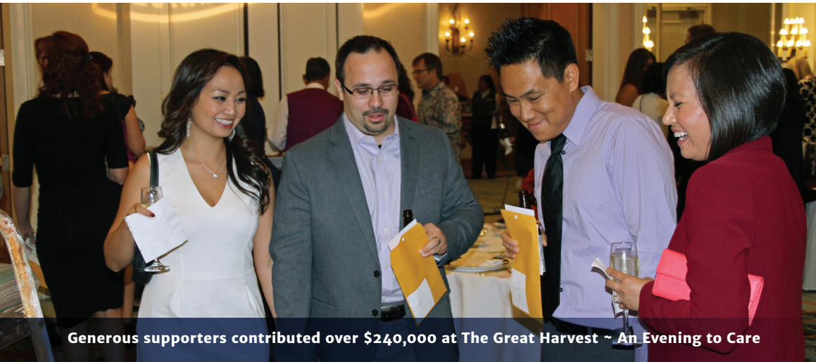
Generous supporters contributed over $240,000 at The Great Harvest ~ An Evening to Care