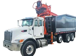
2016 Peterbilt w/ Petersen Atlas AL1

New Petersen Atlas AL1 Grapple truck is equipped with an Allison 3000 RDS-P, Big bit bucket at end of boom, Seated platform that rotates with the boom and more. #150083