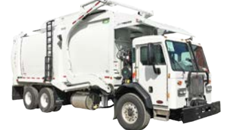
2016 Peterbilt w/ New Way Mammoth

Demo 40 Yard front loader equipped with 16,300 lbs. body weight, 21 sec. complete pack cycle time, 12 sec. complete arm cycle time, Hardox steel in body floor & side, hopper floor & sides and tailgate and more. #160113