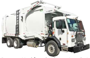
2017 Peterbilt w/ New Way Mammoth

Demo 40 Yard front loader equipped with 16,300 lbs. body weight, 21 second complete pack cycle time, 12 second complete arm cycle time, Hardox steel in body floor & side, hopper floor & sides and tailgate and more. #160016