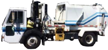
1996 CCC w/ 2005 Labrie Minimax

Used 12 Yard side loader equipped with a 3116 CAT engine, Allison transmission, Dual Perkins car tippers and more. #140066