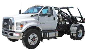
2016 Ford F750 w/ Stellar ECCR

Demo Stellar ECCR equipped with a 8,000 lbs. lifting, dumping and transporting capacity, front and rear load containers, inside and outside controls, extendable and retractable fork body with rotatory and more. #160029