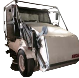
Elgin Pelican Sweeper

Used Elgin Pelican Sweeper is great condition. Equipped with a 2,573 hours, 12k miles, DOT passes and more. #160007