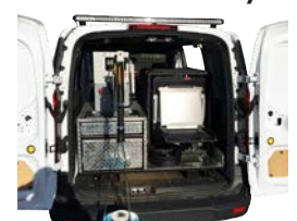
2015 Ford Transit Connect w/ IBAK SI Camera System

Demo is equipped with a IBAK Panorama SI Manhole Inspection Camera System has everything needed to inspect any type of manhole, around 40 manholes daily and more. #150123