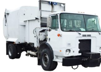
2001 Volvo w/ Wayne Curbtender

Used 20 Yard side loader equipped with a Allison transmission, 44,740 GVWR, 107k miles, 3k hours and more. #160004