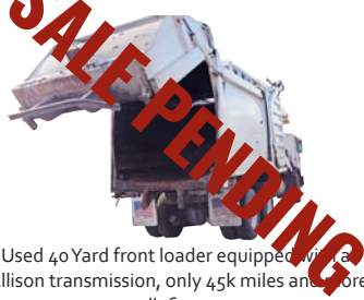
1994 Pete 320 w/ Heil

Used 40 Yard front loader equipped with a Allison transmission, only 45k miles and more. #160101