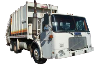
1988 Volvo w/ Leach 2R11

Used 25 Yard rear loader equipped with a Detroit engine, Allison transmission, 56,080 GVWR, Drum winch, Container dump bar, Full eject and more. #6578