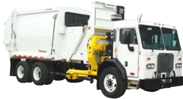
2016 Peterbilt 320 w/ Wayne Curbtender G4

Demo 27 Yard Side Loader equipped with Cummins engine, Allison Transmission, Safety Vision camera system, 2,000 lb. lift capacity, spare gripper holder, clean out tools and more. #150010