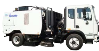
2013 Autocar Expert w/ Scwarze A7 Tornado

Demo is fully equipped with Hydraulic drop-screen, 600 gallon water capacity, 8.4 Yard hopper, dual gutter brooms, Gutter broom extension override, regenerative air and more. #6788