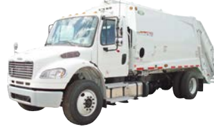
2017 Freightliner M2 106 w/ New Way Cobra

Demo 20 Yard Rear loader equipped with Cummins ISL 270Hp, Allison 3500RDS-P, Lightweight body, externally mounted cylinders for easy maintenance, Auto-lock tailgate, LED lights, Variety of container handling options and more. #160126