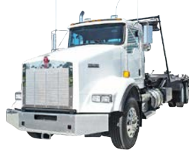
2017 Kenworth T800 w/ AA Endless Chain Hoist

Demo Continuous Chain Roll-Off Hoist equipped with 60,000 lb. chain pull, Dual planetary gear drive, Heavy duty hook carriage, Boom slow down, 22 feet of usable rail and more. #160010