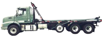
2016 Volvo w/ Advantage Roll-Off Hoist

Demo Continuous Chain Roll-Off Hoist equipped with 60,000 lb. chain pull, Dual planetary gear drive, Heavy duty hook carriage, Boom slow down, 22 feet of usable rail #160012