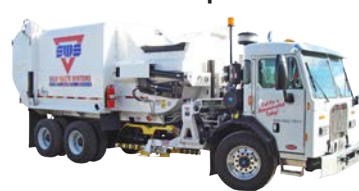
2015 Peterbilt 320 w/ Dadee Scorpion ASL

Demo 27 Yard Side Loader equipped with Cummins ISX12, Allison 4500 RDS-P, 1,600 lb lifting capacity, Arm reach of 8 feet, Eaton electrical components, LED work lights and strobe lights, Tip to dump body and more. #140145