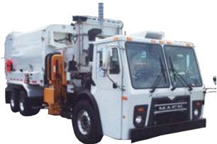
2016 Mack w/ Labrie Automizer

Demo 31 Yard Side Loader equipped with a Heavy duty arm & grabber for 32 to 95 gallon containers, Clean out tools, LED multi-function strobe lights, Extension for 300 gallon containers, 3rd Eye camera systems and more. #140122