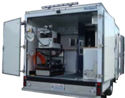
2015 FORD F-350 w/ IBAK Pipeline Inspection Van

Demo 2015 IBAK Pipeline Inspection Van equipped with Orion zoom PAN & Tilt camera, a T66 camera tractor that has zero turn radius and full steering with ATC and more. #140116