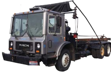
1985 Mack w/ Endless Chain Roll-Off

Used Endless chain roll-off equipped with a CAT engine, Automatic transmission, 11k Hours, 113K mileage and more. #150004