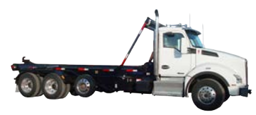
2017 Peterbilt 567 w/ Advantage Roll-Off Hoist

Demo Continuous Chain Roll-Off Hoist equipped with 60,000 lb. chain pull, Dual planetary gear drive, Heavy duty hook carriage, Boom slow down, 22 feet of usable rail #160079