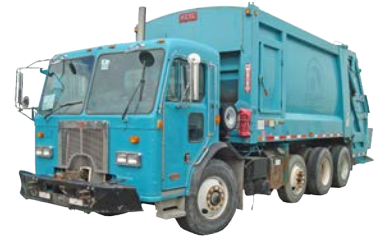
2000 Peterbilt 320 w/ Heil

Used Rear Loader equipped with Cart tipper and more. #150100