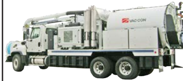
2017 Freightliner 114SD w/ Vac-Con Combination

Demo Vac-Con Combination truck is equipped with Hydraulically operated front mount hose reel, Operating controls in front, Polyethylene water tanks, High capacity water pump, Debris body dump control on side of truck and more. #160074