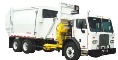
2016 Peterbilt 320 w/ Wayne Curbtender PLC

Demo 27 Yard Side Loader equipped with Cummins engine, Allison Transmission, Safety Vision camera system, 2,000 lb. lift capacity, spare gripper holder and more. #150113