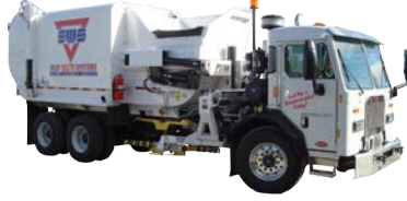
2017 Peterbilt w/ Dadee Scorpion

Demo 27 Yard automated side loader equipped with a Cummins ISX, an Allison transmission, transmission mount PTO driven hydraulic pump, Triple Safety Vision camera system, arm shake feature, an auto lube and more. #150164