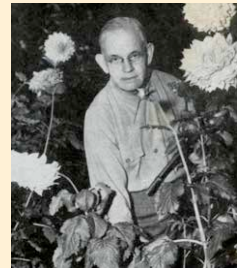
DAHLIA SOCIETY OF GEORGIA CONTINUES TO PROMOTE DAHLIAS