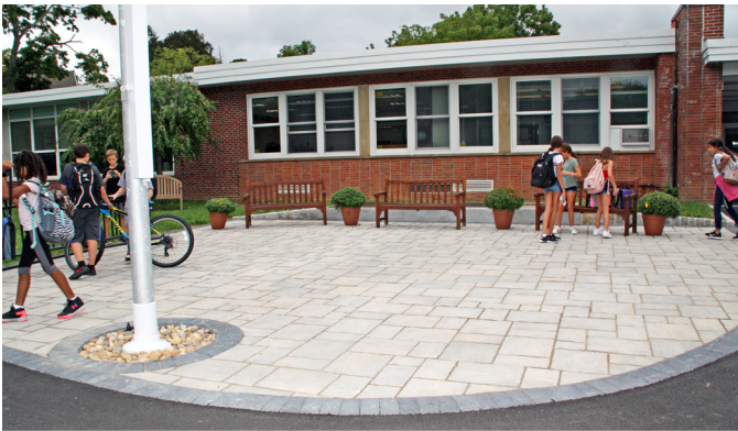
New front entrance area at the Middle School