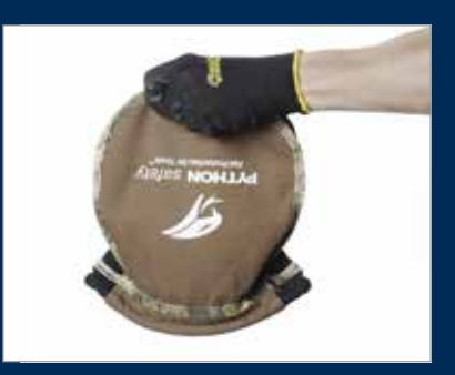
Even when the pouch is flipped vertically, the pouch traps objects inside, making it nearly impossible for items to fall out.