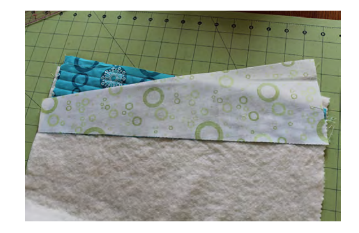
Step 7. Press seam towards second piece. Quilt as desired.

Step 6. Place the second trimmed piece right sides together with the first piece, alternating narrow and wide ends as shown in photo. Align raw edges. Stitch using a ¼" seam allowance.