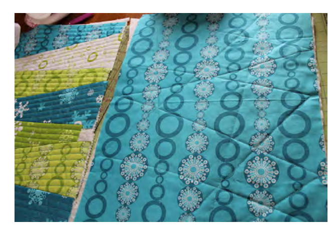
Step 4. Trim the seven 5'' \times 15'' rectangles of exterior fabric as shown in photo at right. Note measurements in photo.

Step 3. Pin one rectangle of batting to the wrong side of the 15" x 20" rectangle of exterior fabric. Quilt as desired. Set aside.