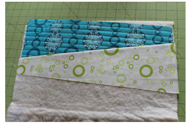
Step 8. Repeat steps 6 and 7 until all seven pieces are sewn and quilted.