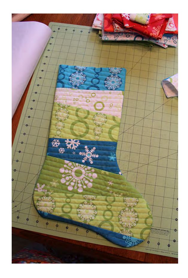
Step 14. Fold the lining fabric in half, right sides together.

Step 15. Trace the stocking pattern onto the lining fabric. Pin around the seam lines.