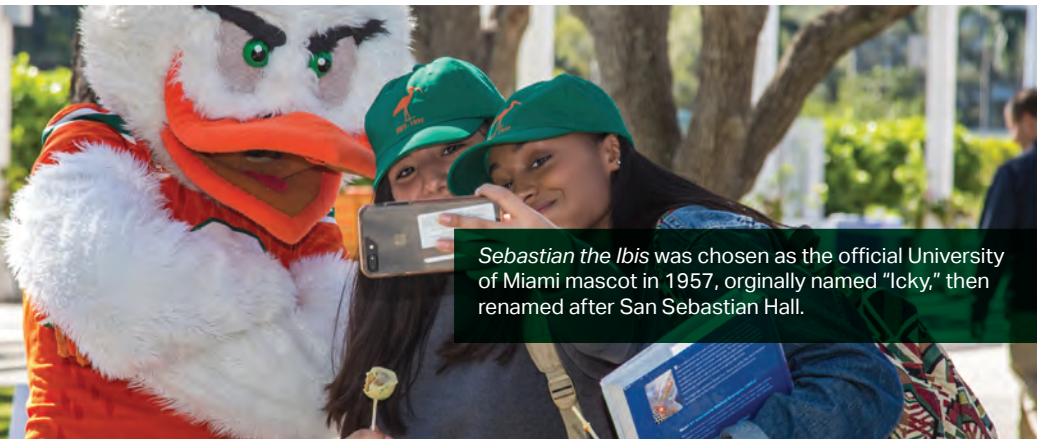
Sebastian the Ibis was chosen as the official University of Miami mascot in 1957, originally named "Icky," then renamed after San Sebastian Hall.

Supports a variety of recreational activities including intramural sports, club sports, outdoor adventures, fitness classes, and wellness programs housed at the Patti and Allan Herbert Wellness Center and Lakeside Village.